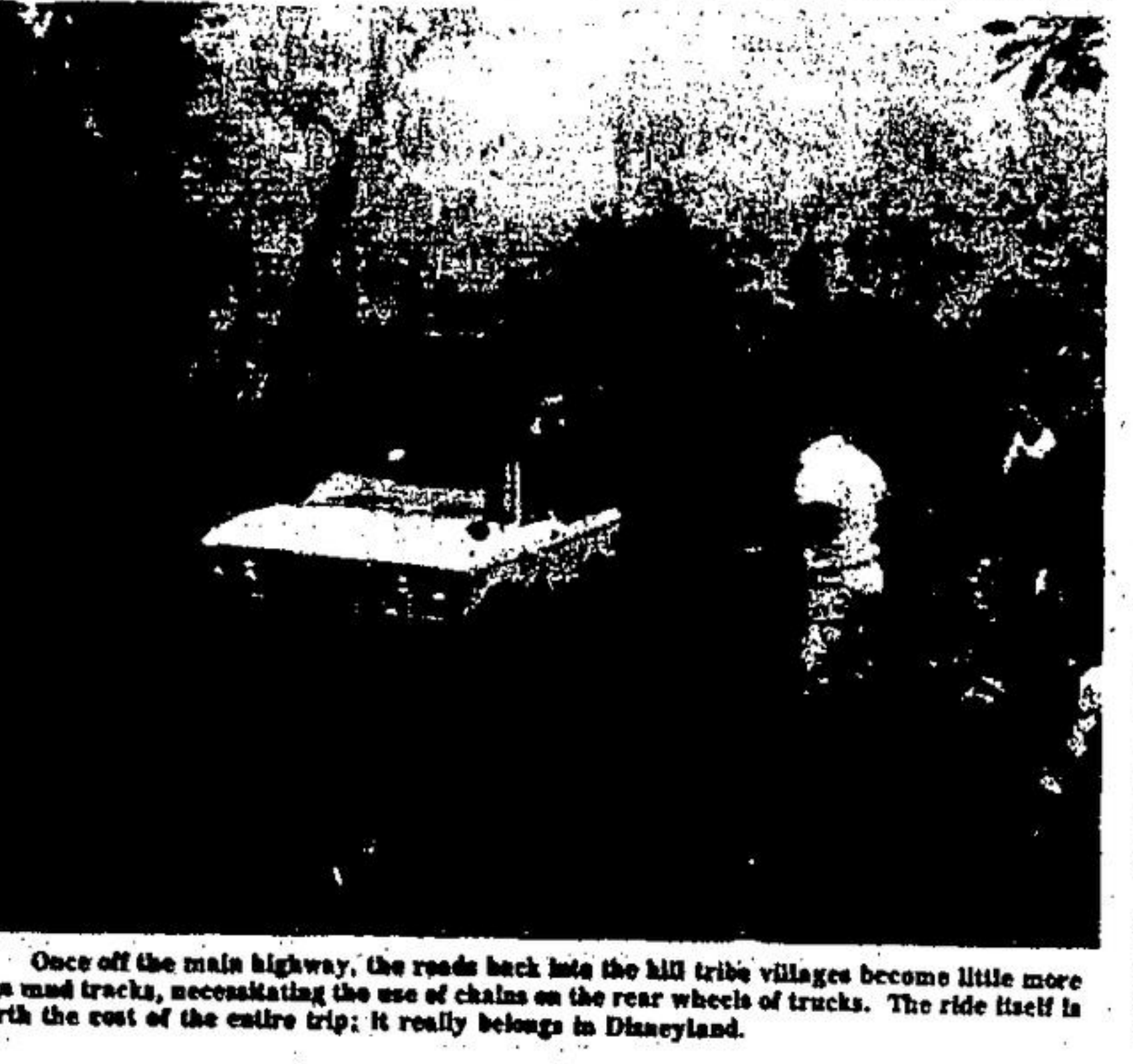
Once off the main highway, the roads back into the hill tribe villages become little more than mud tracks, necessitating the use of chains on the rear wheels of trucks. The ride itself is worth the cost of the entire trip; it really belongs in Disneyland.