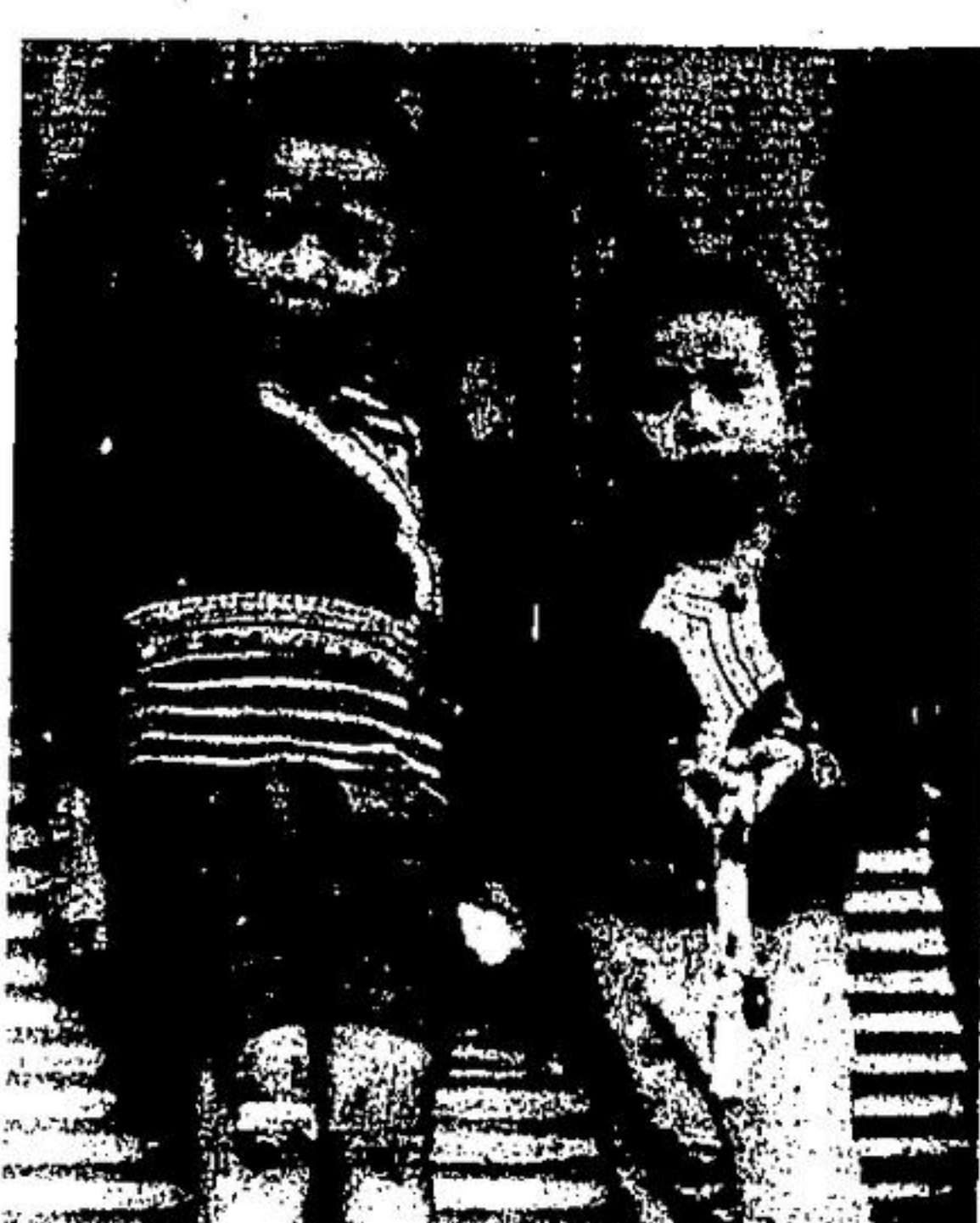
These hill tribe children posed for a picture for the author in a village above the city of Chiang-Mai. The one young lad has a few rhinoceros beetles tied to his stick.