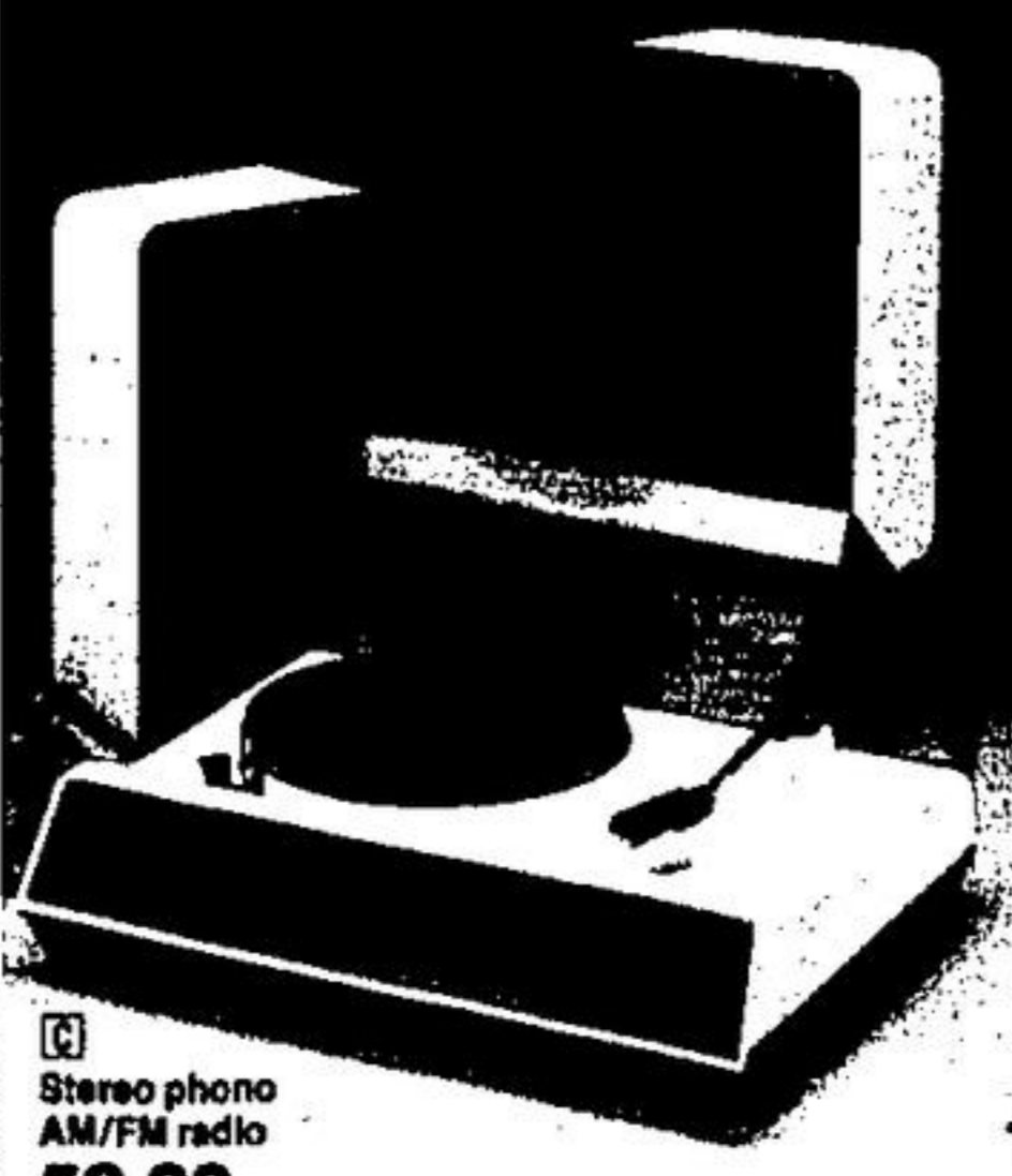
C Stereo phono AM/FM radio 59.99