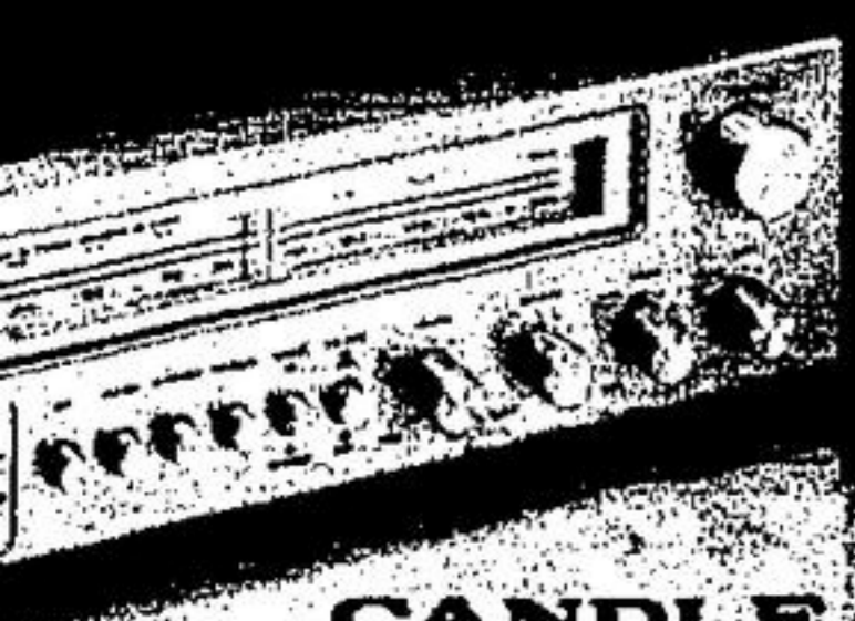
B CANDLE All the sound you need!