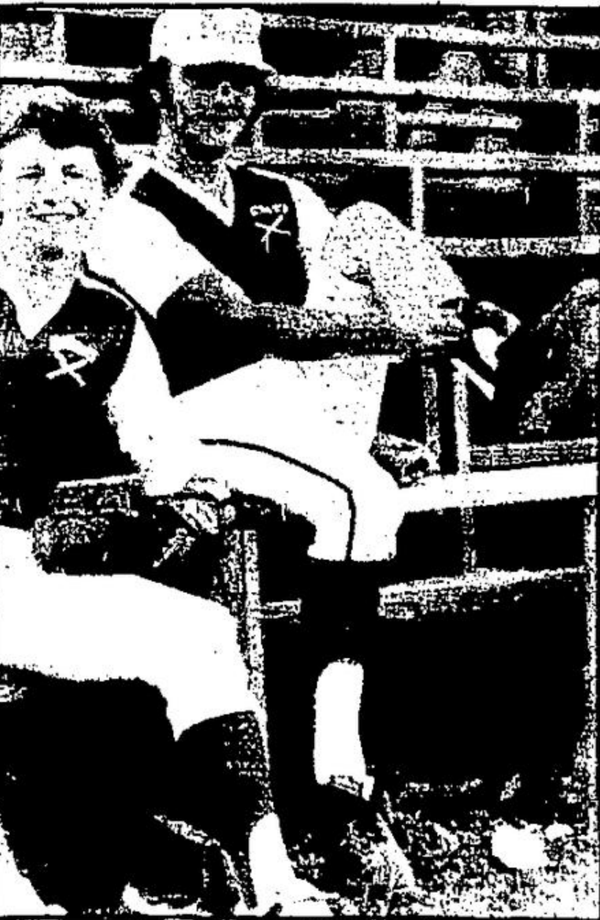
The Merchants had better pull their socks up. They are in seventh place in the industrial fastball league.

Cricket is the game played on a smooth surface and cannot be played surrounded by soccer goal posts in the playing area.