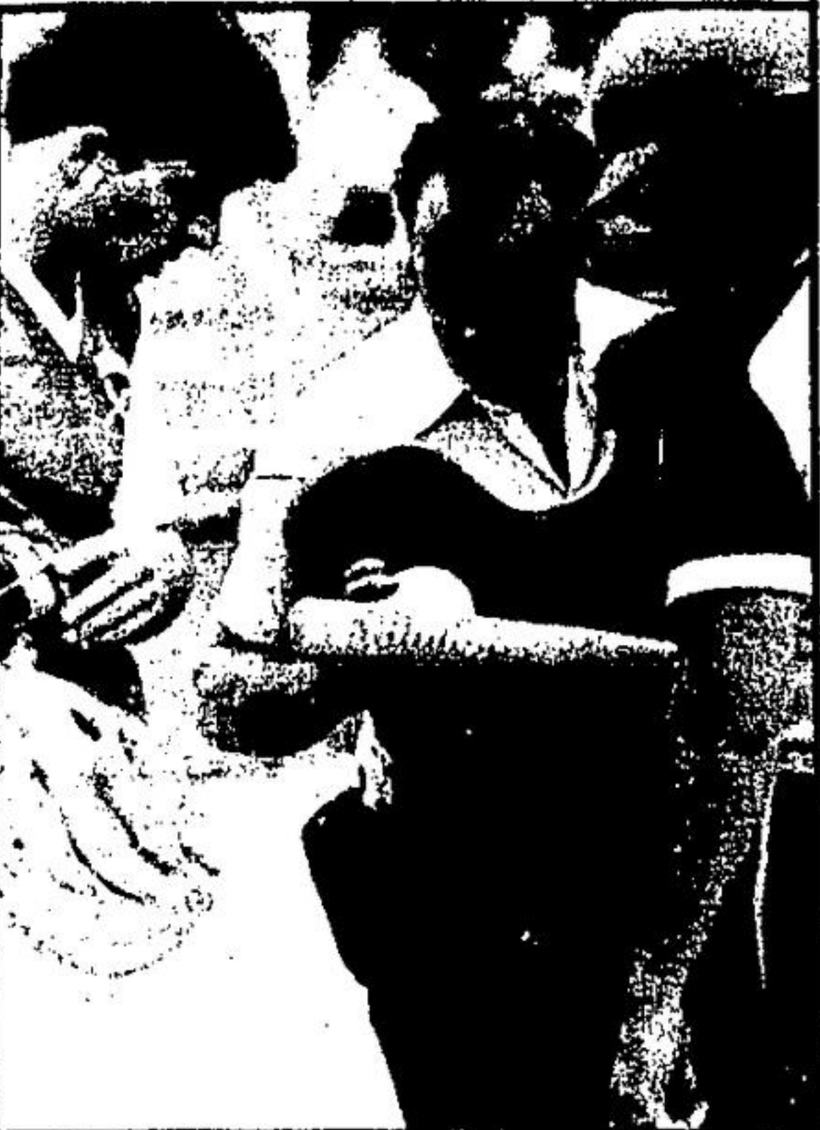
Making sure the ball is in top shape is a priority for everyone from the catcher through the umpire to the batter.