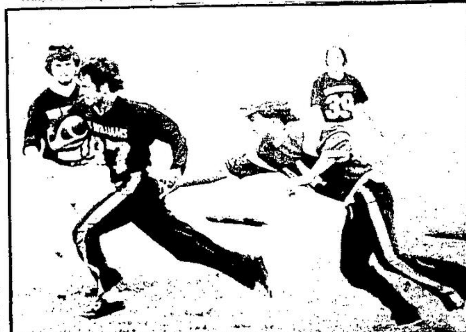
GET YOUR HAND OFF MY FLAG