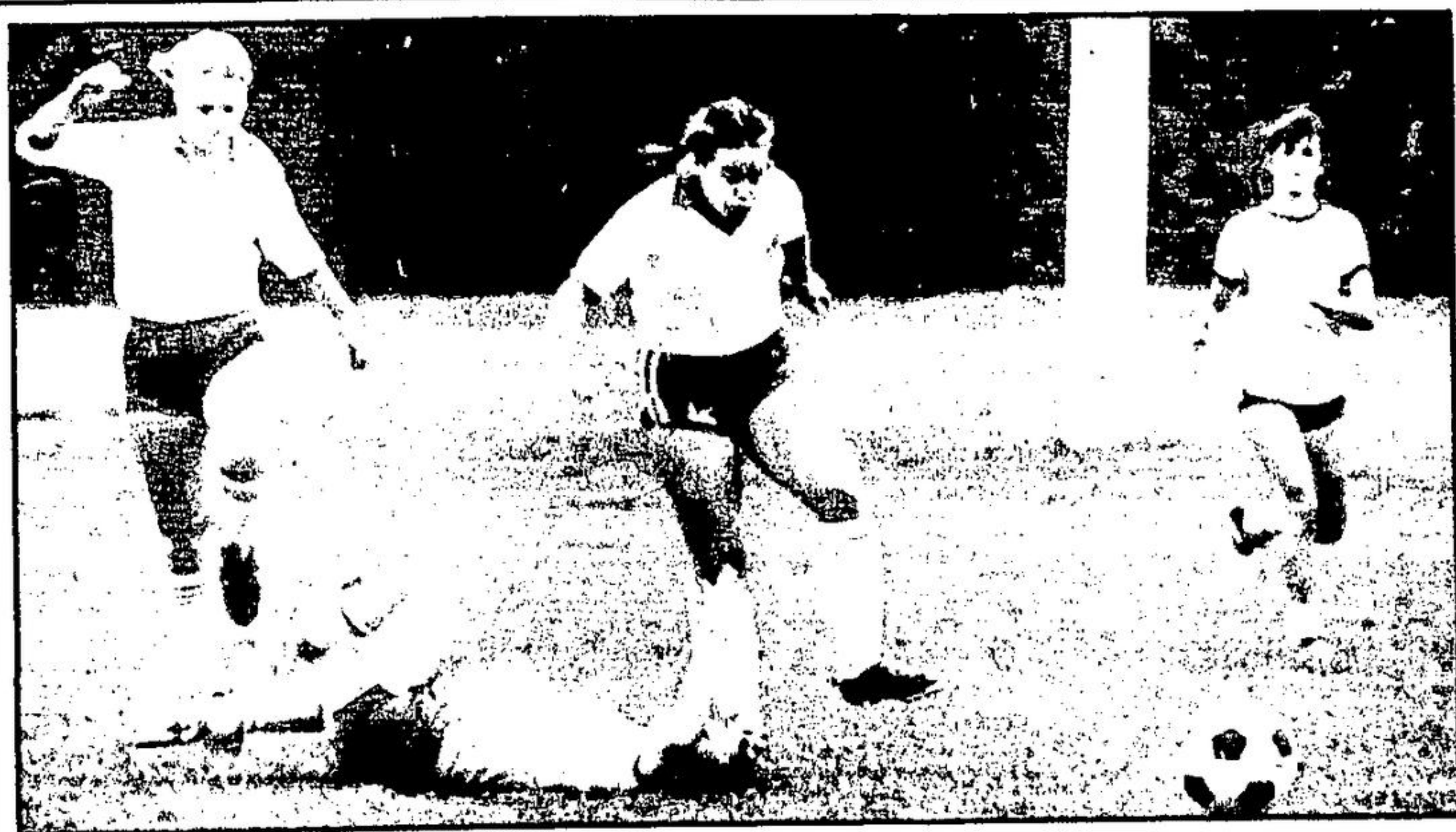
ON THEIR WAY TO 11 - 1 WIN

The Georgetown girls senior rep soccer team were all over their opponents from Ferris, Sunday afternoon in Ontario Cup play at Cedarvale. They won the game 11-1 with many similar plays to this, where the homeside's offense was just too much for the defense.