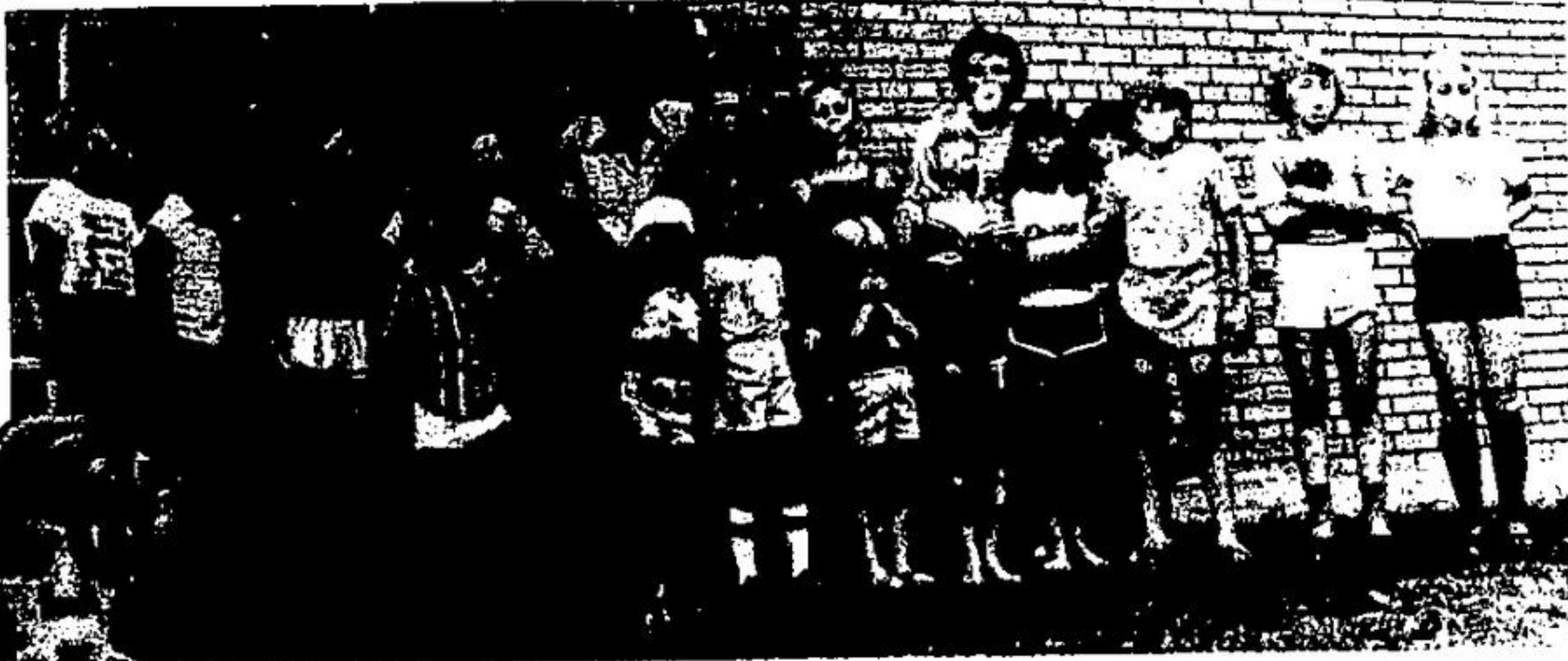
Snap, crackle and pop, but try as they might to blow the perfect bubble, Acton Library's bubblegum chewing contest Saturday proved to be quite a mouthful for these youngsters. The bubblegum blowing contest is one of a number of events sponsored by the South Central Library System and the Halton Hills Public Library Board. Recently the board was given permission to use pupper characters from "Where the Wild Ones Are" in its Wild Reading Club.