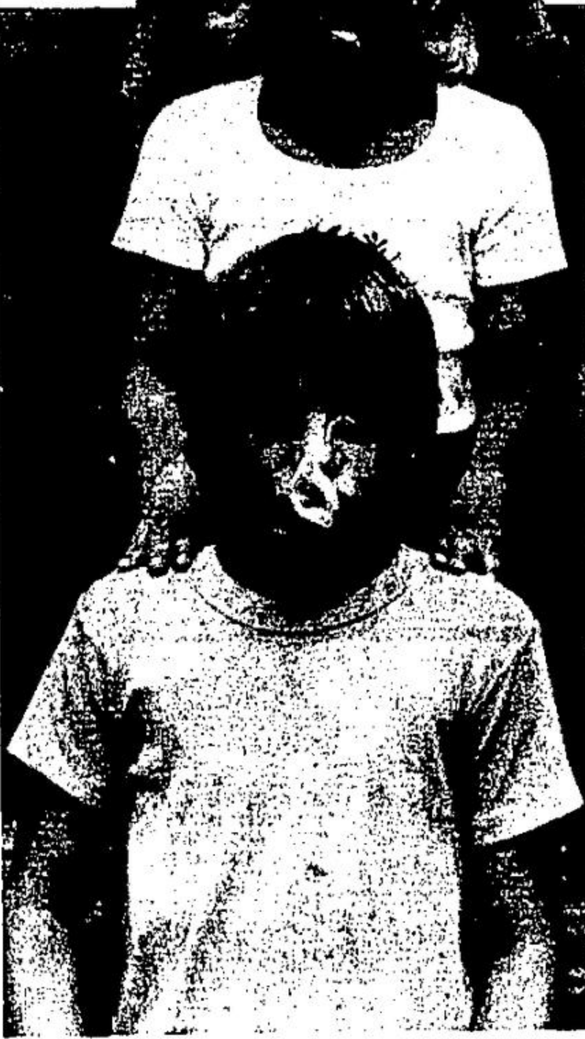
Twenty-one youngsters received proficiency certificates for their bubblegum blowing skills at the Acton library Saturday. Both libraries in Acton and Georgetown will be sponsoring a number of events during the summer. Sign language stories are planned for Georgetown this week and indoor gardening for eight year olds is upcoming.