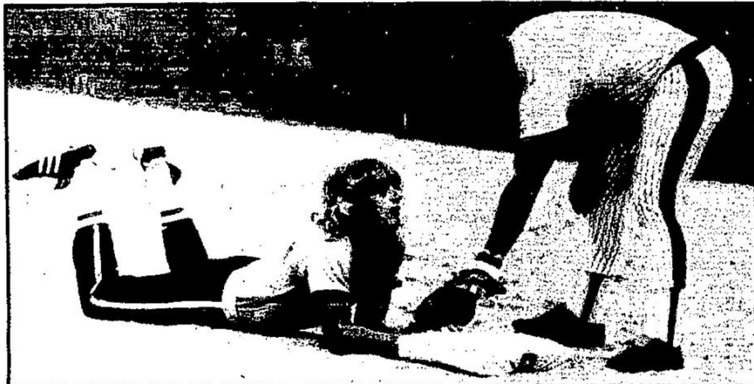
YOU WOULDN'T PUT ME OUT