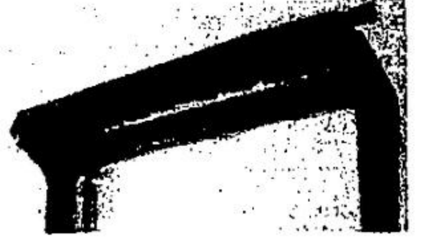
LIGHT WHEN YOU WANT IT!