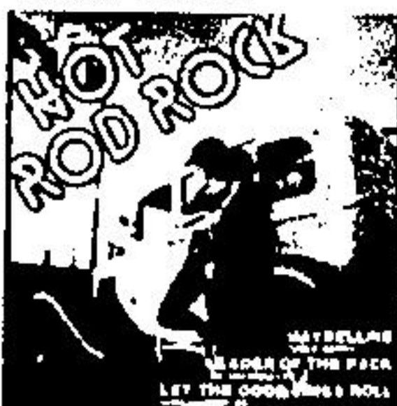
"Hot Rod Rock"