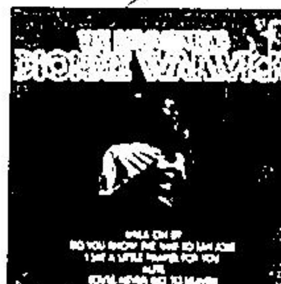
"The Devastating Dionne Warwick"