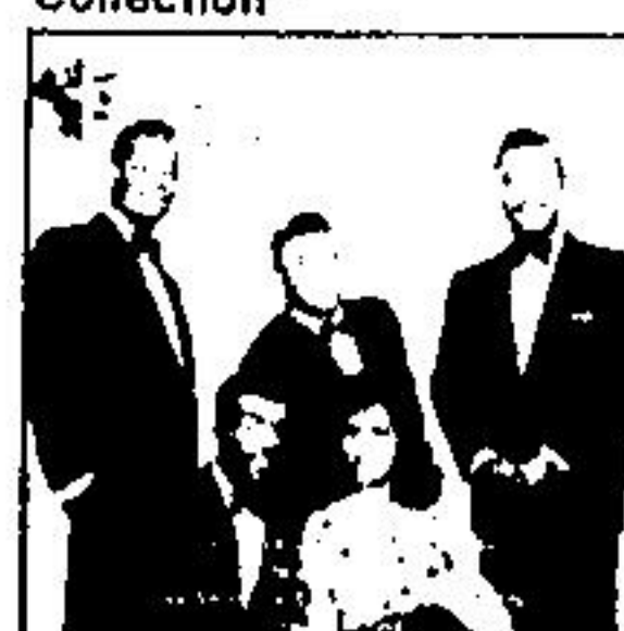
"The Magic Touch Of The Platters"