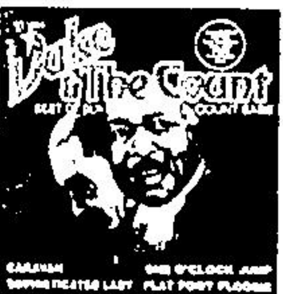
"Duke & The Count"