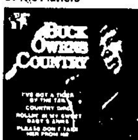
"Buck Owens Country"