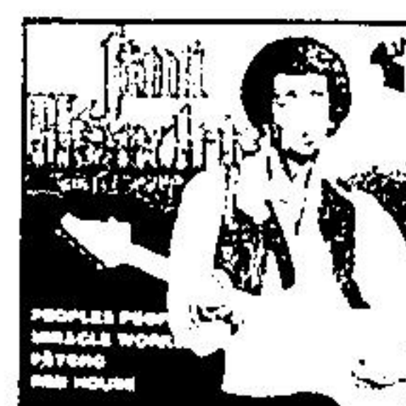
"The Jimi Hendrix Collection"