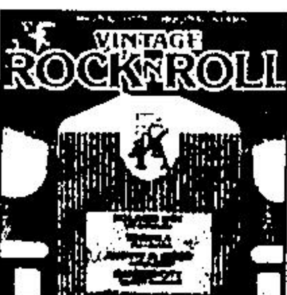
"Vintage Rock N Roll"