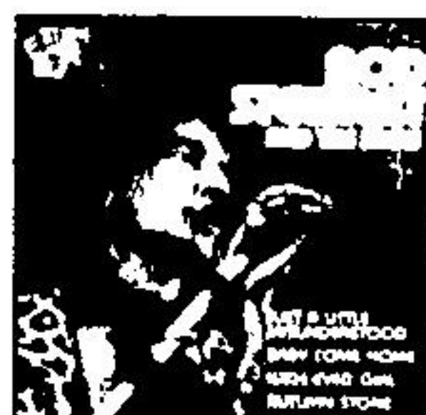
"Rod Stewart And The Faces"