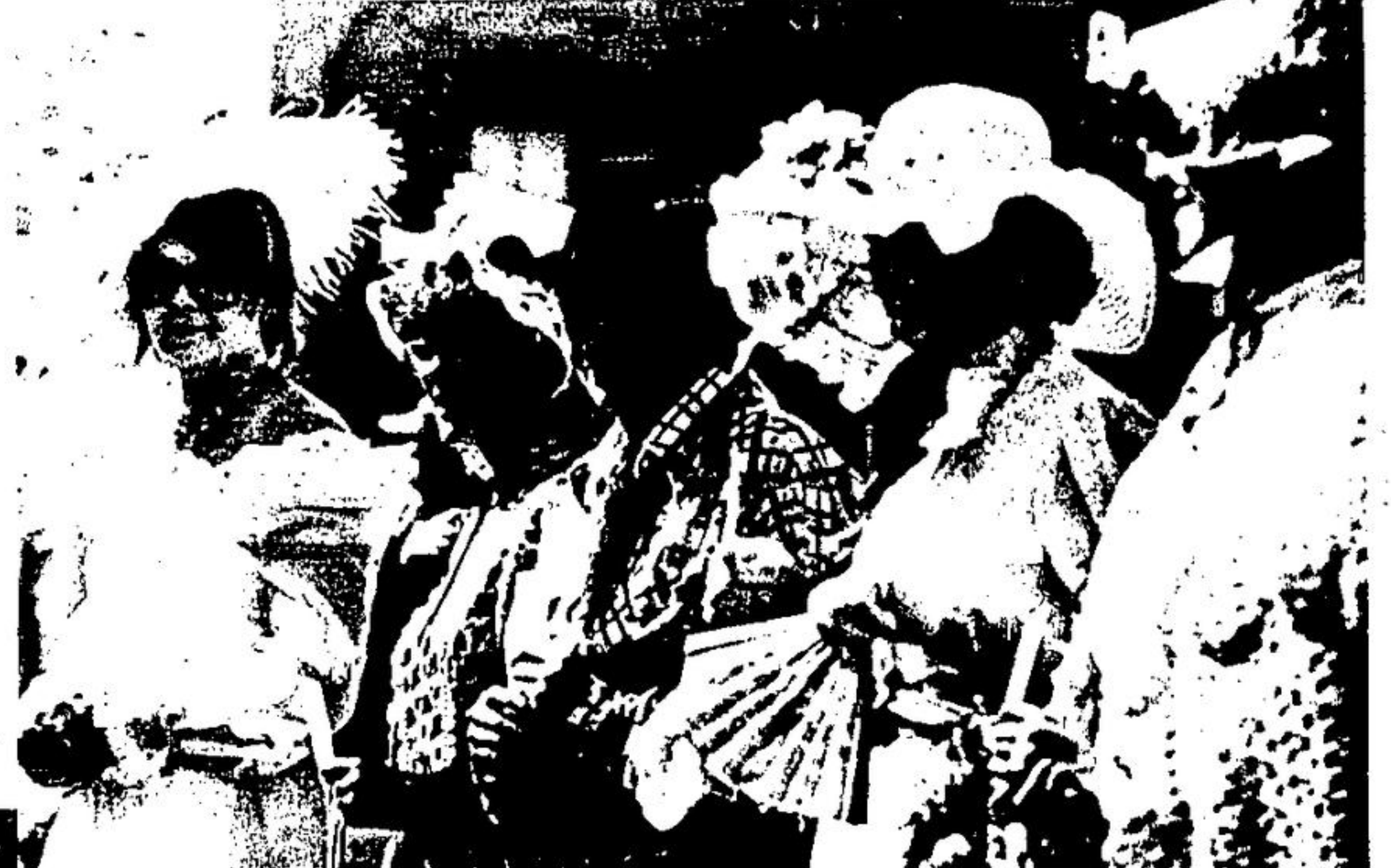
The old-time pioneer costume contest proved popular among the ladies' entrants, but the men were a touch too bashful to enter. The painstakingly tailored outfits added to the "old time" atmosphere of the Pioneer Days-Summerfest weekend.