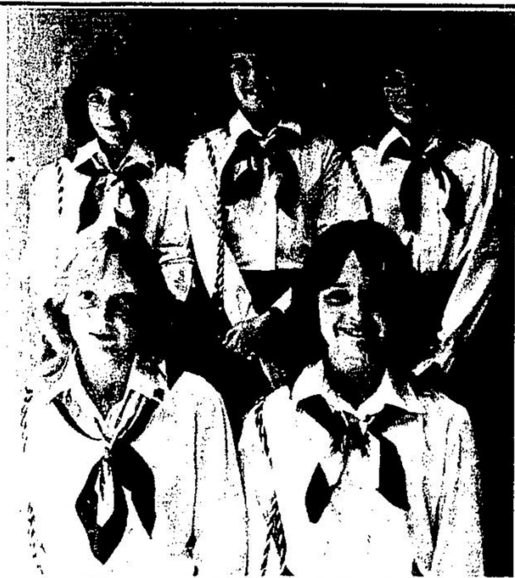
FIVE NEW PATHFINDERS