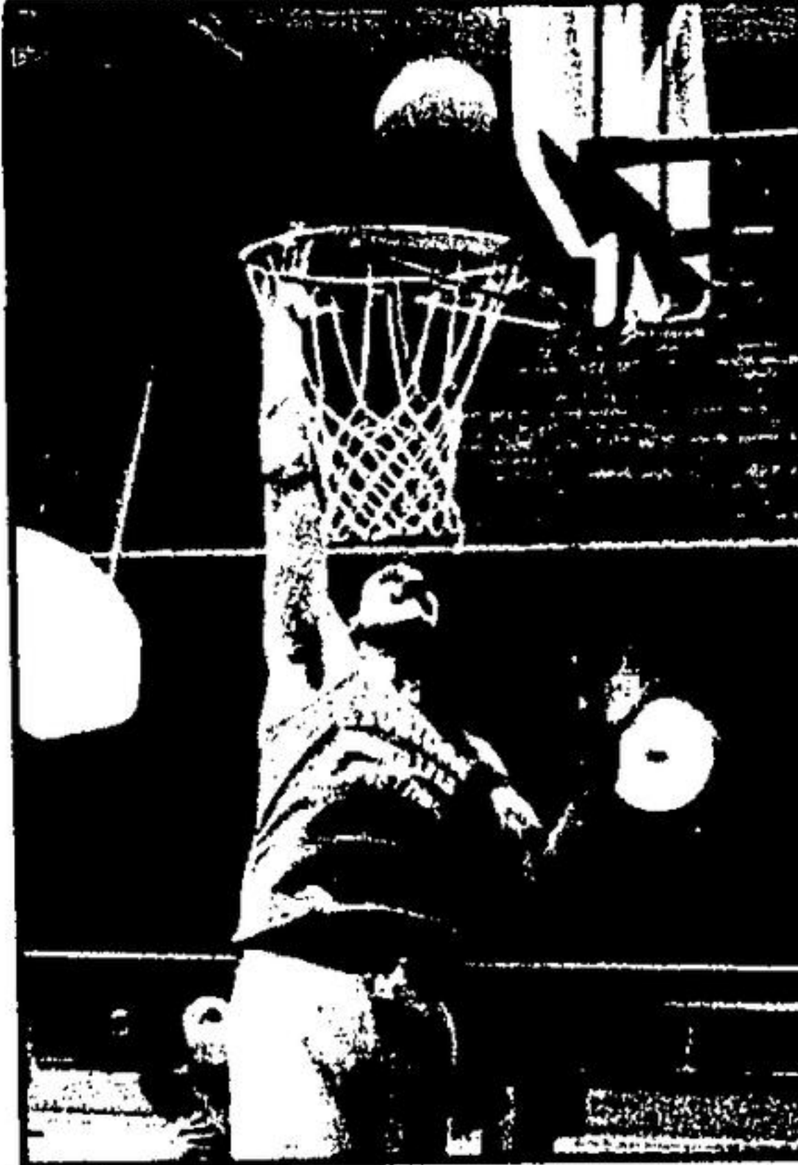
The Braves were lucky Piston shots like this one missed.