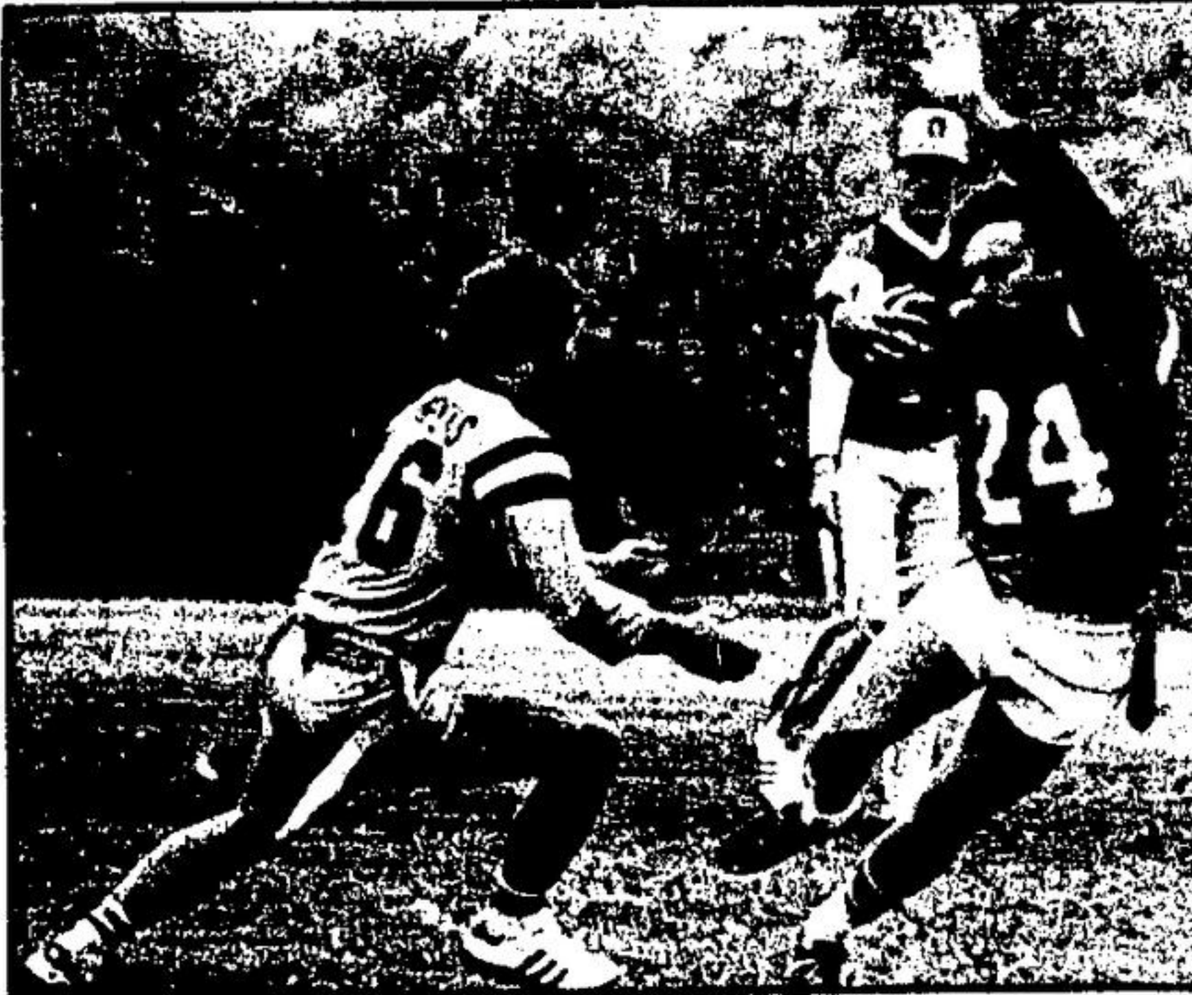
As usual it's speed and dexterity that makes the difference in flag football action. Sunday morning some of the eight teams had it, some didn't.