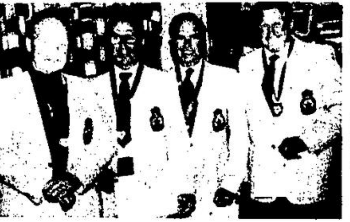
Legion Senior curlers won the Ontario Championship and went on to represent the province at the Nationals in Woodbridge where they placed third.