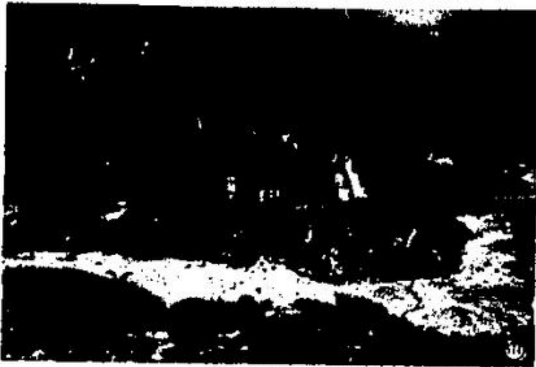
CANCUN boasts twelve miles of palm-lined beach, a wealth of spectacular hotels, a championship 18-hole golf course, and enough water sports to satisfy even the most enthusiastic aquaphile.

the ancient walled city of Tulum, where 56 Mayan monuments are well-preserved, and Chichen-Itza, where the ruins date back more than 3,000 years.