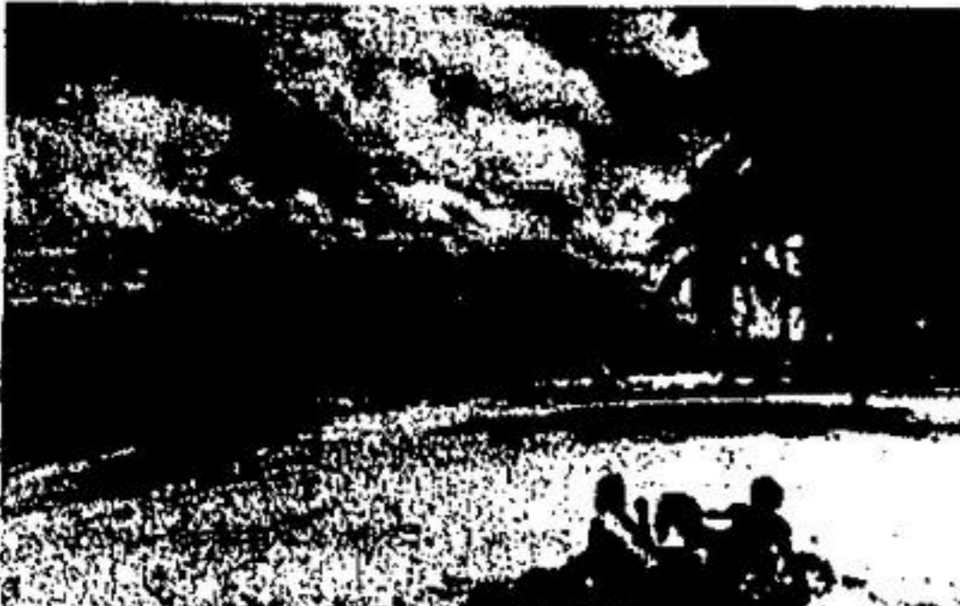
WHILE YACHTING to the Bahamas, why not take a respite on the shore of one of many deserted beaches? Relax, enjoy the warmth of the tropic sun and warm your skin to a golden brown.