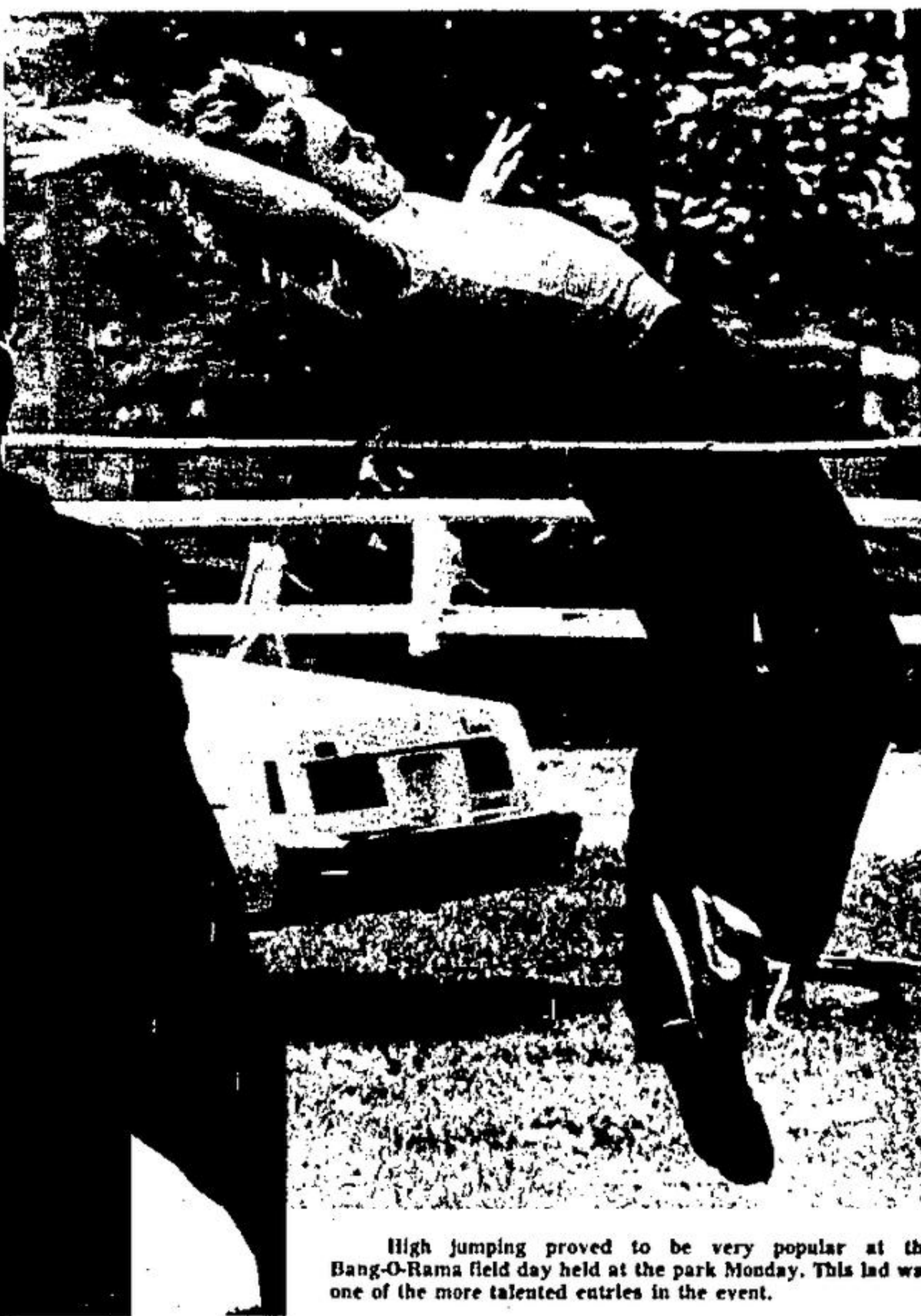
High jumping proved to be very popular at the Bang-O-Rama field day held at the park Monday. This lad was one of the more talented entries in the event.

"We have no problems getting people out for the fireworks, but what we try to do is get events going to bring people out in the day time and make a day of it," he said.