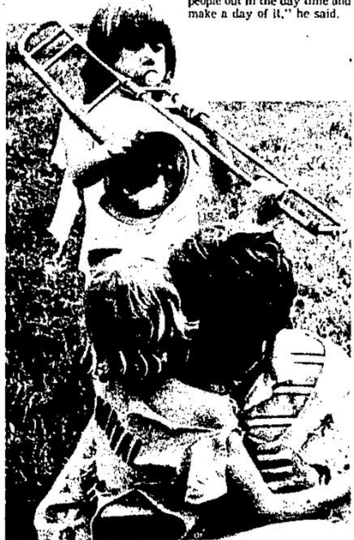
While one of the delightful Norval clowns comforts a maiden in distress, this young lady is finding time to blow her own horn. It must be admitted she had rather mixed success.