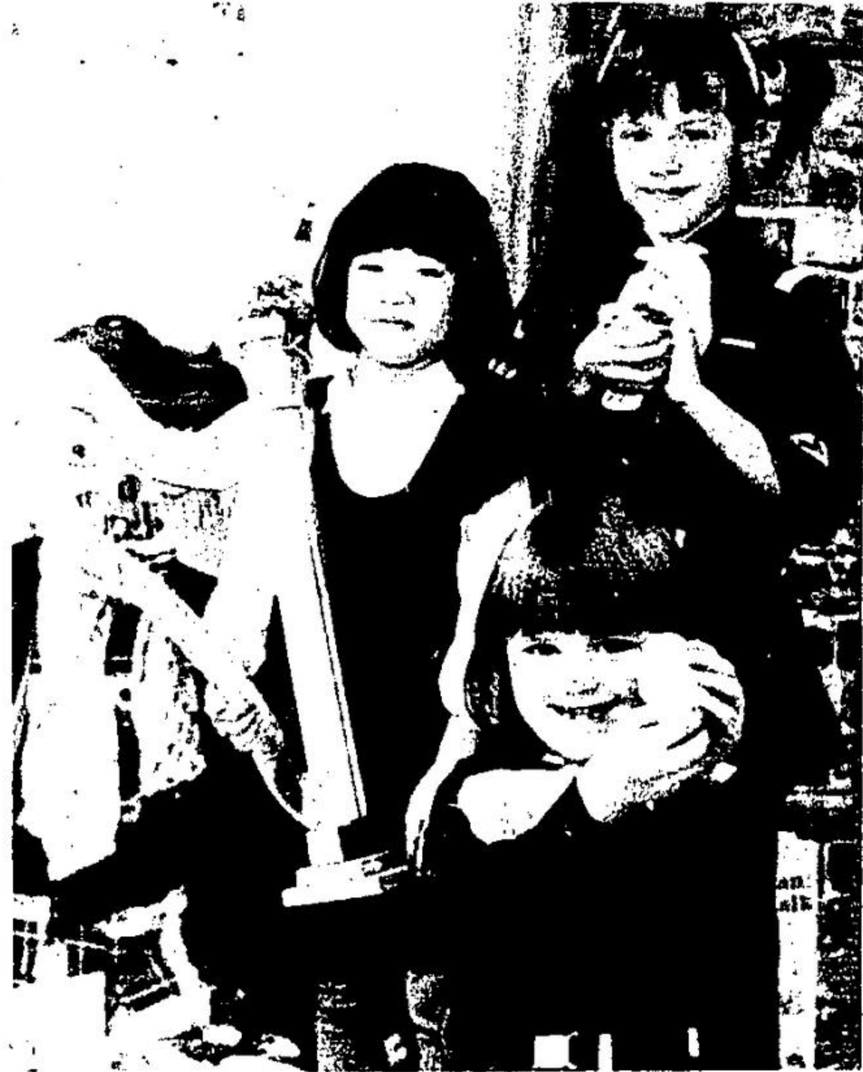
24-KARAT FABLE