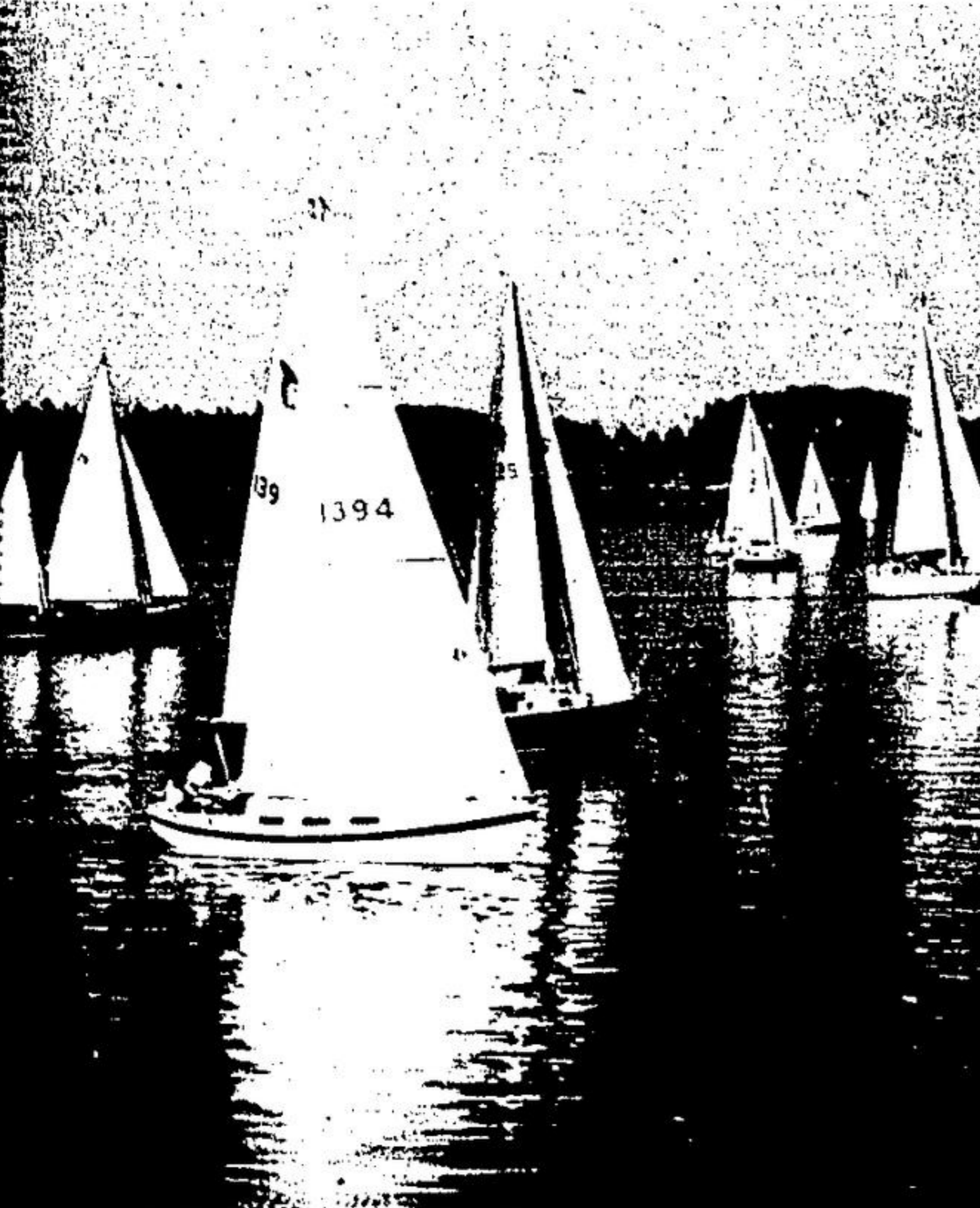
A sheltered location in the southern Gulf of St. Lawrence and 1,100 miles of sandy shores guarantee first-class sailing opportunities on Prince Edward Island! Graceful sailing craft accent the natural coastal beauty of 'the Island.' Also, in the summer, numerous yacht races test the skill and valor of the sailing buffs from the east coasts of Canada and United States.

The entire family will enjoy the best that sailing has to offer on the south shore facing the sheltered Northumberland Strait only 14 km (9 miles) from New Brunswick and 22 km (14 miles) from Nova Scotia. The north shore overlooking the Gulf of St. Lawrence