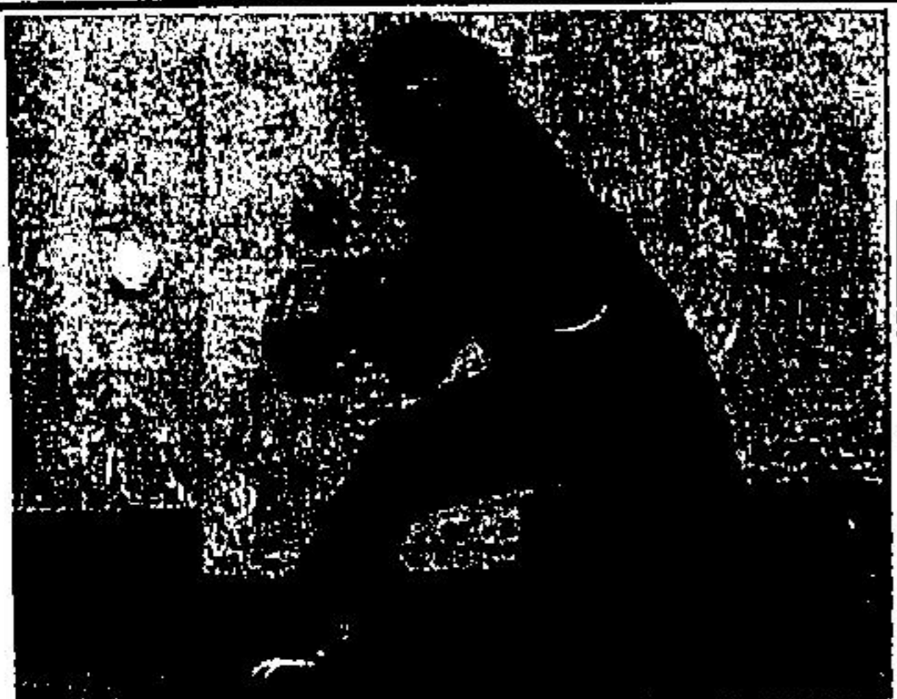
It's a good thing this is still spring training. A missed ball like this could cost the Glen Warriors a game. The team is practicing indoors at Harrison Public School Monday nights but, the team hopes to get on the diamond this weekend in preparation for their Inter County Fastball league start May 8.

Canadian Tire was the triple-game winner this season with a high of 3,947. The McGibbon Hotel were a close second with 3,945 points. Royal Pizza picked off the high single game total with a score of 1,495, while Canadian Tire was just behind at 1,477.