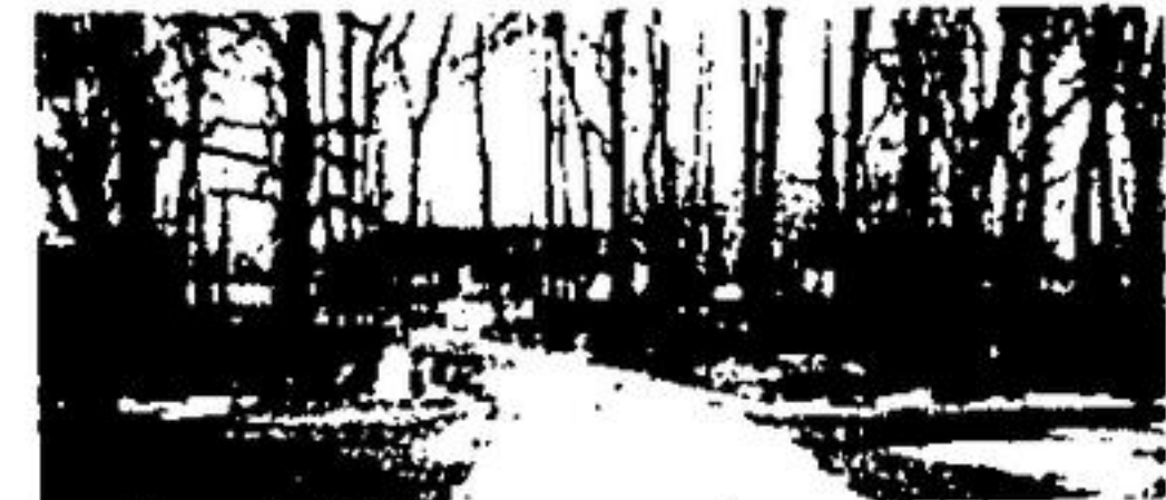
DON'T PASS ME BY

"ADDED ATTRACTION THIS SUMMER" Four bedrooms, 2 baths, main floor family room, den with fireplace, kitchen, living room and dining room. This home is a must to see, new wall to wall carpet last year and recently decorated. Enjoy all of these features now and appreciate the 16'x32' Inground pool this coming July. Right! Call John Caton for all the information.