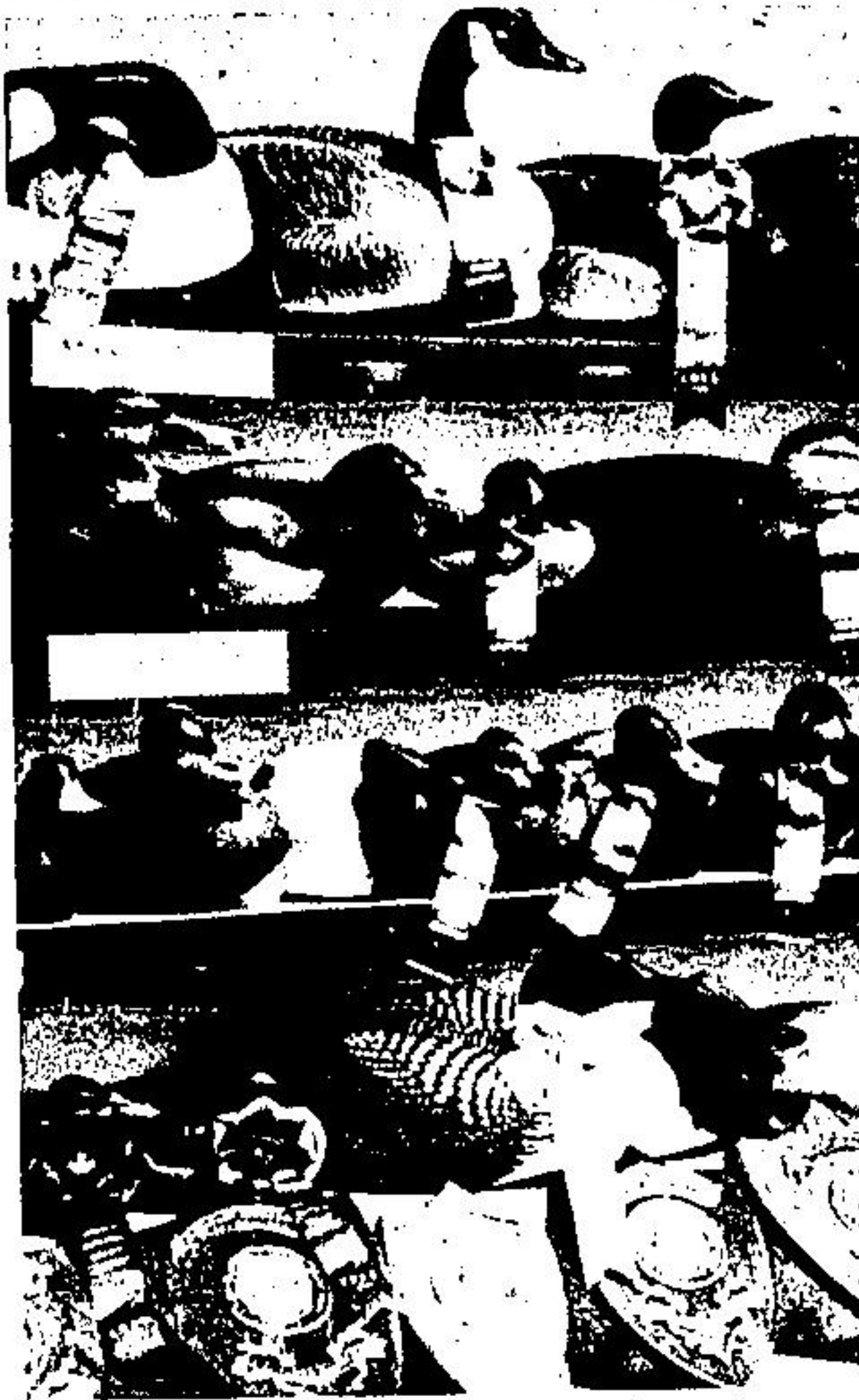
Award winning sitting ducks, or decoys as they are known.

Just a reminder of the Isaac Walton Fly Fishing Club forum on Mar. 28-30 at the Holiday Inn, Toronto