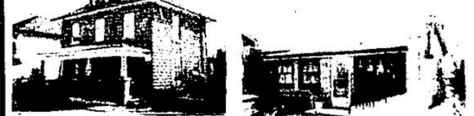
A good investment now with outstanding potential as well. This building presently zoned for general commercial (C2) on one of the busiest corners in town. Asking $79,900 with good existing mortgaging. Call Bill Ellis for potential picture on this one.