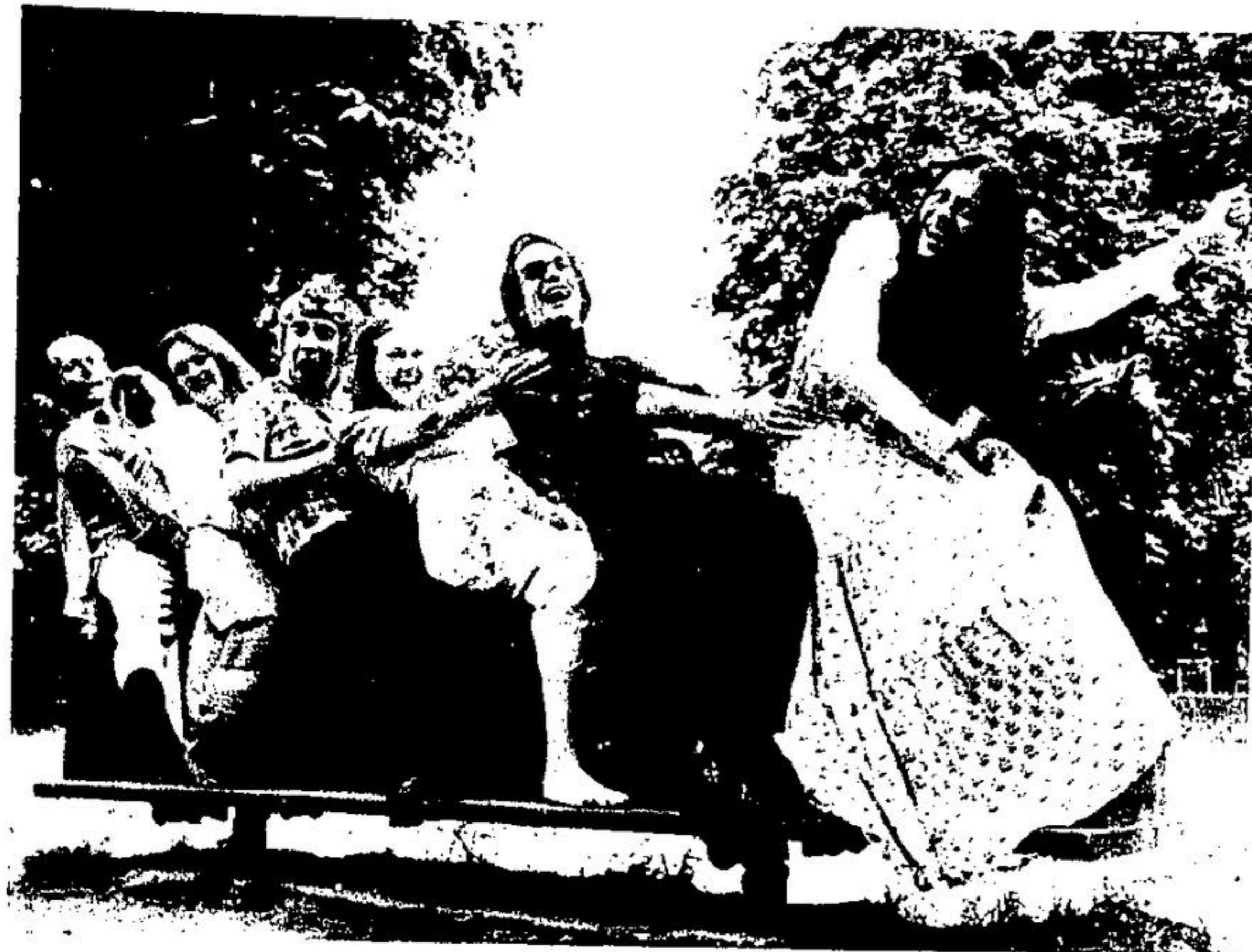
Camerata returns to Georgetown next Wednesday