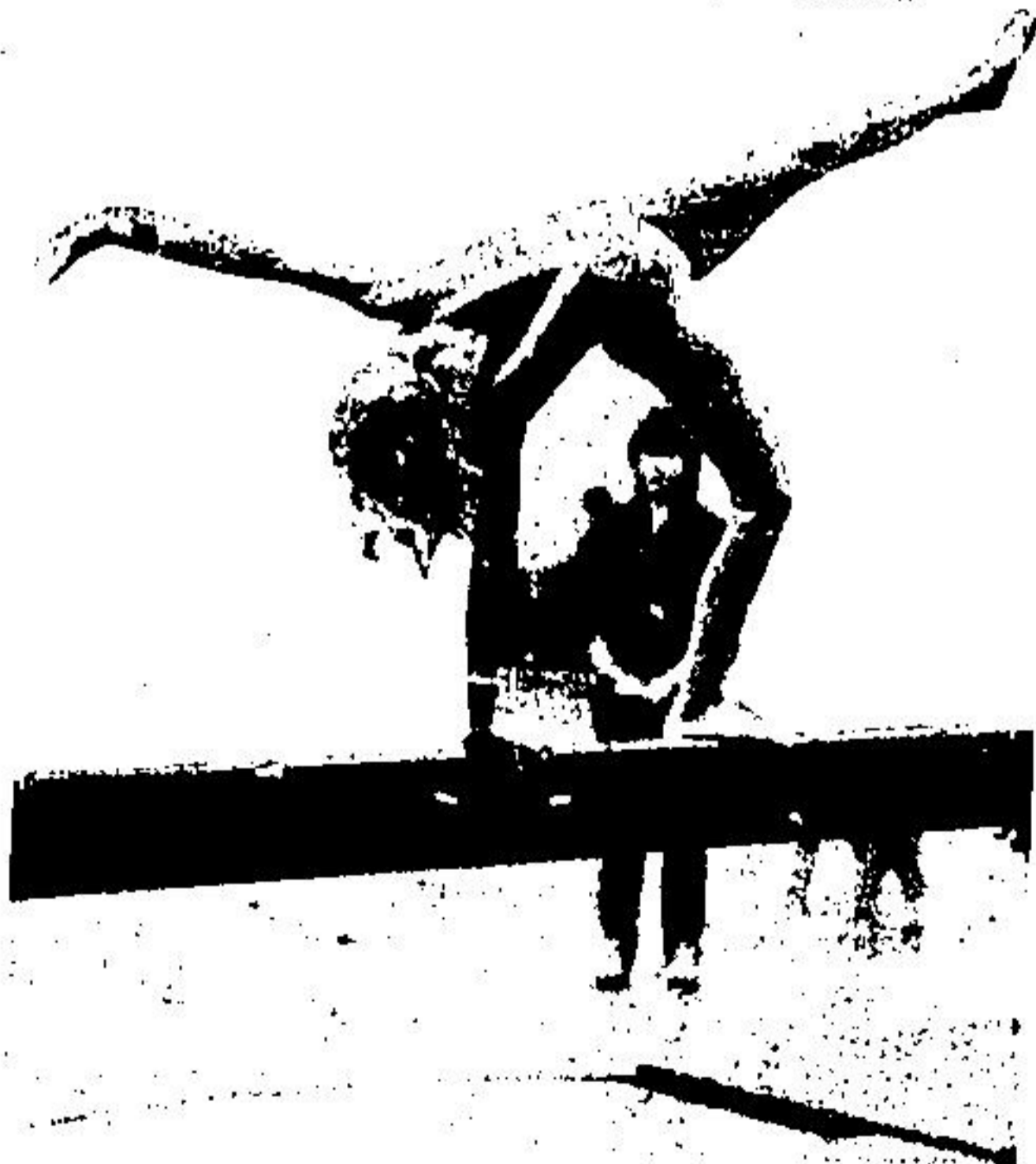
The Jills competed for the first time on some new equipment they purchased recently. The club is now looking for a place where the equipment can be set up and left set up, for practises.

The Jills will host an all-Halton Hills meet for pre-competitive and recreational gymnasts, sponsored by McDonald's, on March 8.