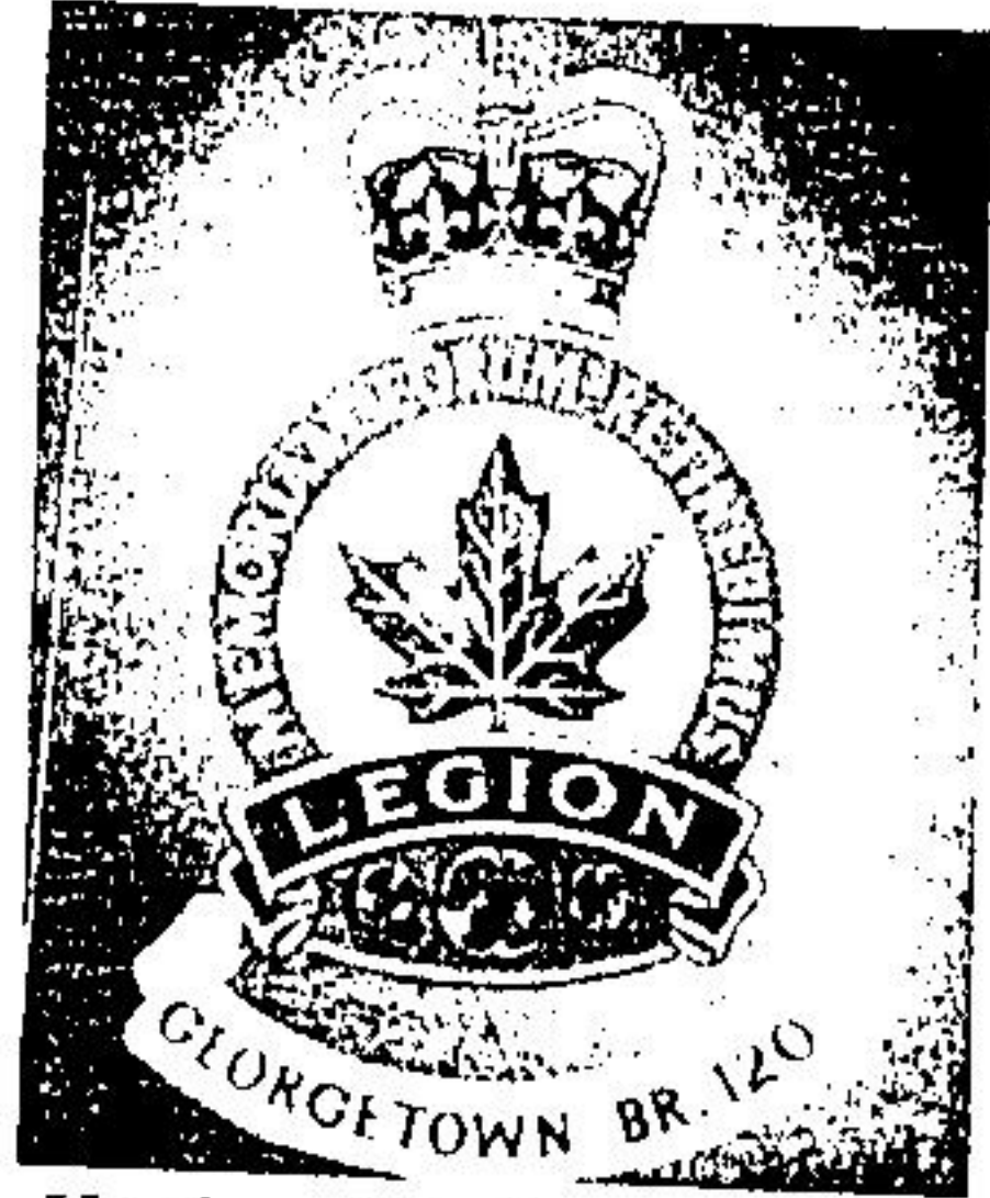
Hockey Heritage award