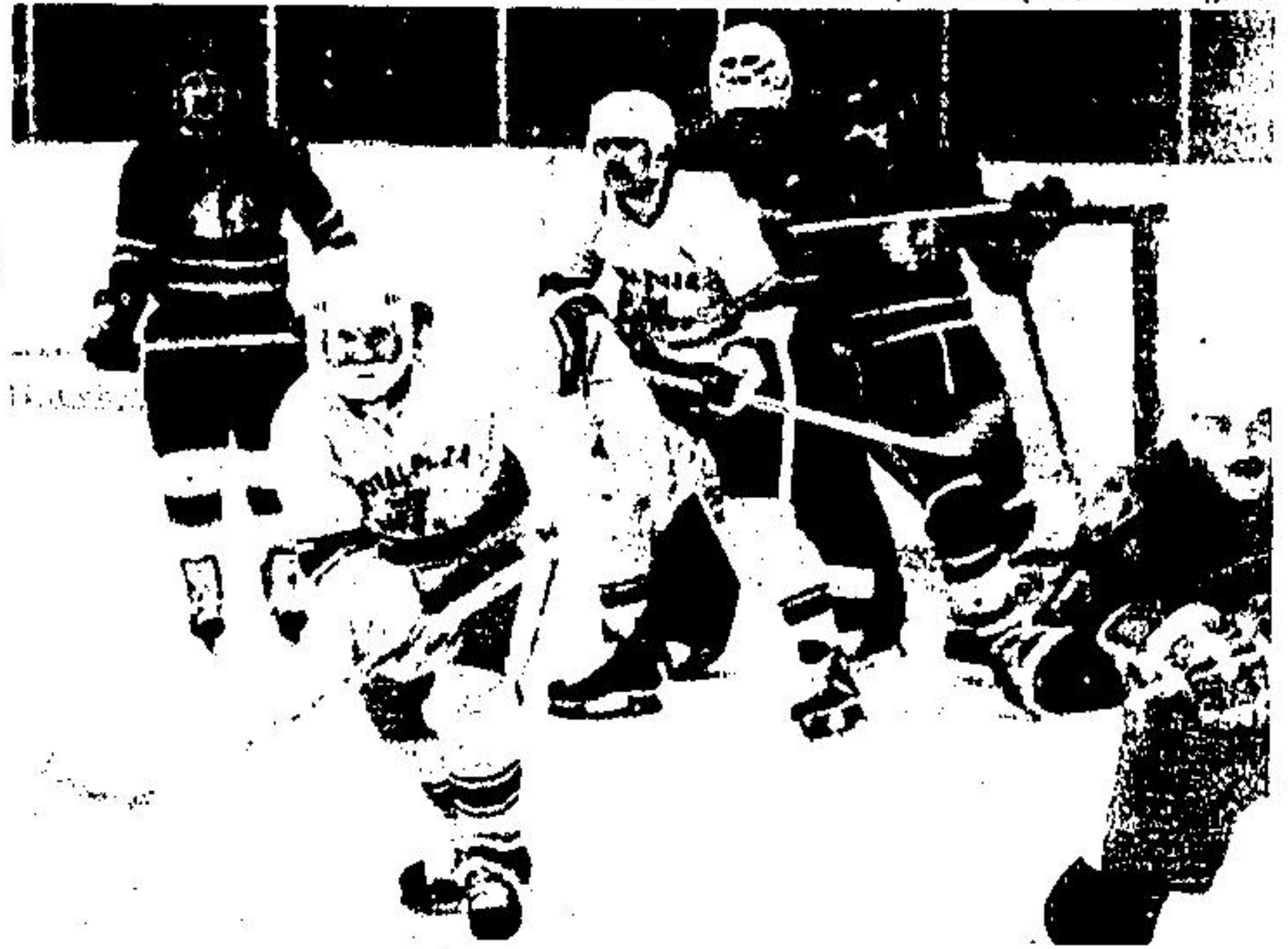
Royal Pizza had to do a lot of hustling in Sunday morning's industrial hockey game against the Glen Warriors. However, they didn't do enough as they lost the game 8-1.

United Rental blew a big chance to stay in the race for second spot in the standings with a 5-2 defeat by Philp Publishing. A win for them