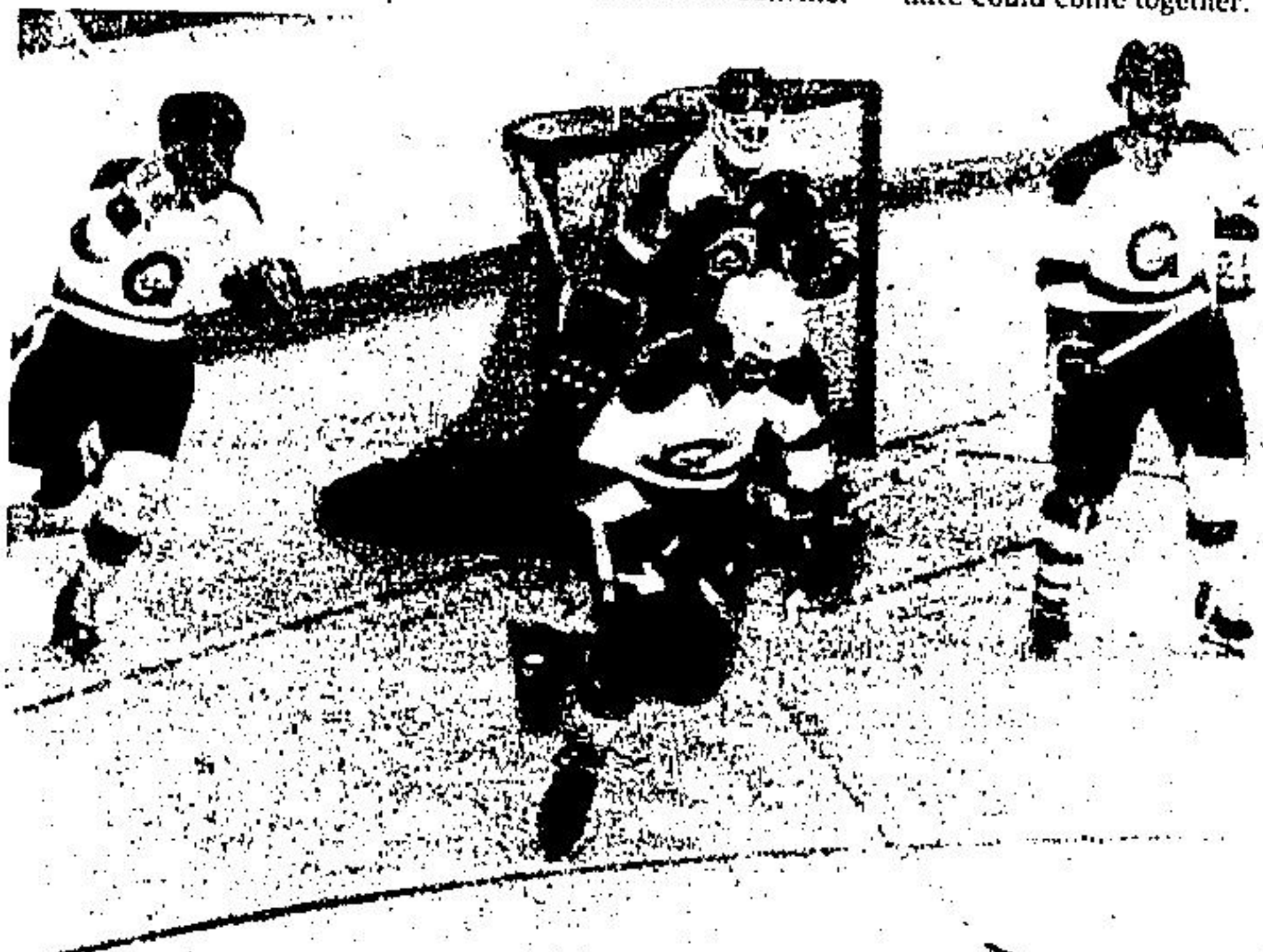
Gems playoff bound

By the way the Gems are playing they could be the upset team of the playoffs, where all of their work to date could come together.