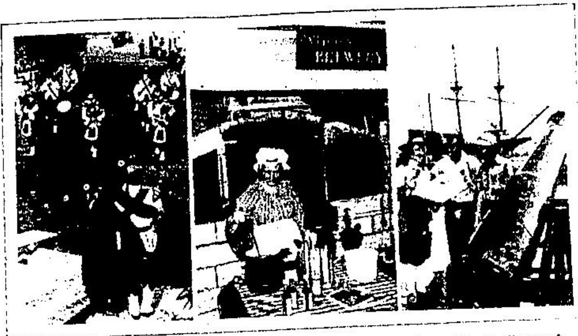
HAMILTON, Bermuda - Rendezvous Time, Dec. 1 to March 15, gives visitors a glimpse of bygone days on Bermuda. Wednesdays, a traditional skirling ceremony (left) is performed by Scottish dancers, pipers and drummers; Tuesdays, local wenches (center) can be found serving complimentary fish chowder and draught beer at Market Day; and on Mondays and Saturdays the town clerk of St. George's (right) can be heard telling all within earshot of the daily happenings.

Later in the day in downtown Hamilton, local artisans gather for Market Day, displaying and producing a wide range of crafts. Also part of the Market is an English pub where visitors can quaff a mug of complimentary draught beer or indulge in a cup of Bermuda fish chowder ladled by a waitress in an 18th century English costume.