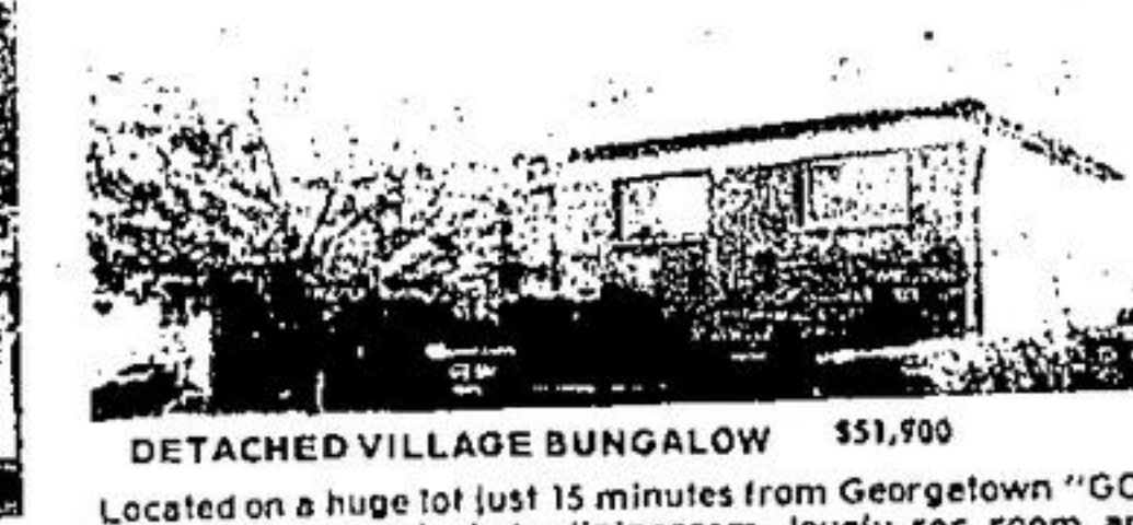
DETACHED VILLAGE BUNGALOW $51,900 Located on a huge lot just 15 minutes from Georgetown "GO" Train. Features include diningroom, lovely rec room and garage. Call Sandra Nairn for more details.