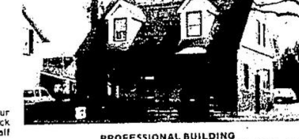
PROFESSIONAL BUILDING This commercially zoned brick building offers three large offices plus reception on the main floor, a self-contained single bedroom apartment upstairs and ample room downstairs for a boardroom and extra offices or secretarial staff. Tastefully decorated with plenty of paved parking space right downtown. Call Rob Allison for information on this smart investment.

THE OLD DURHAM STATION - L.L.B.O. LICENSED RESTAURANT A unique experience on this three acre property overlooking the salmon filled Saugeen River. Dining room seating capacity is 140. Owners living quarters, 2 bedrooms with sloped ceilings. For further information please contact John or Howard Caton.