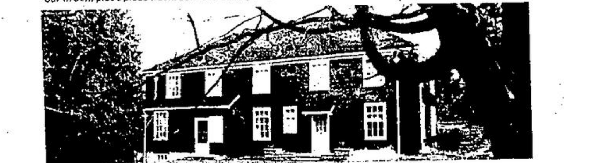
GEORGETOWN 300 ACRES Huge estate home, 100 x 40 foot barn with silo, supported by 3 other outbuildings and two other separate houses for hired help. This property is located 35 minutes northwest of downtown Toronto with easy access to Hwy. 401. By appointment only. Call Sandra Nairn at 453-1111 or 877-1380.