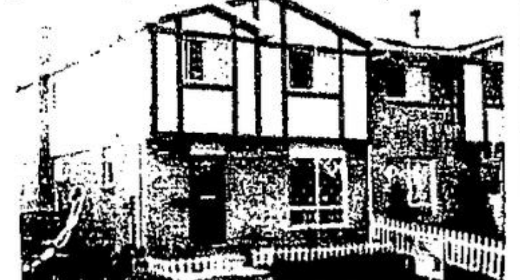
A TIME TO LOOK — A TIME TO BUY 10 1/2 PER CENT FIRST MORTGAGE This four bedroom, semi detached home has a $40,000.00 Kinross Mortgage due March 1981. Close to GO bus stop. Asking $55,000.00. Call Eleanor Langdon for an appointment to inspect.