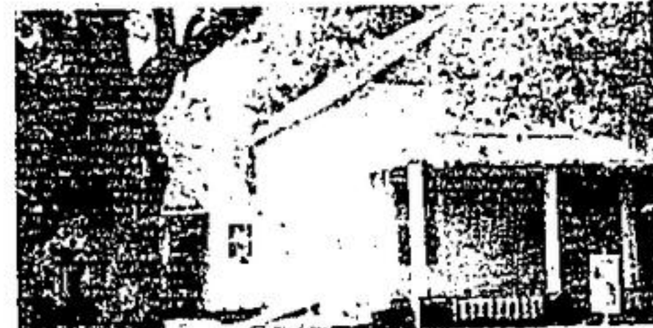
NEAR GO STATION—$48,500.00 Single family, two or three bedroom home has maintenance free exterior siding. Near Public and High Schools. Call Eleanor Langdon for an appointment to inspect.