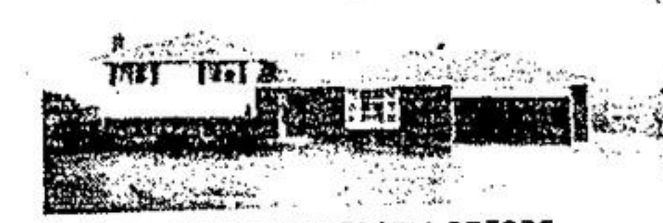
WOULD LIKE TO SELL BEFORE CHRISTMAS—10 1/4 PER CENT FINANCING Ten minutes from GO Train and beautifully maintained. Four bedrooms 2 baths walkout from family room also with brick floor to ceiling fireplace and double car garage on a half acre. Asking $85,900.00 Call John Caton