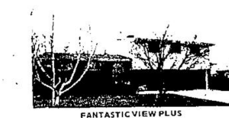
FANTASTIC VIEW PLUS Large family home, 4 bedrooms, 3 walk-outs to treed maples. Super outdoor barbeque plus 3 fireplaces, bar in den, plus 2 piece washroom and 2 car garage. Call Arlene Shorthill-Wannop

BUILDING LOT - IN TOWN One of the last remaining building lots in town has just been listed. This interesting site features ninety seven feet of frontage and is one hundred and thirty five feet in depth and only five minutes walk from downtown. Call Rob Allison for all the details.