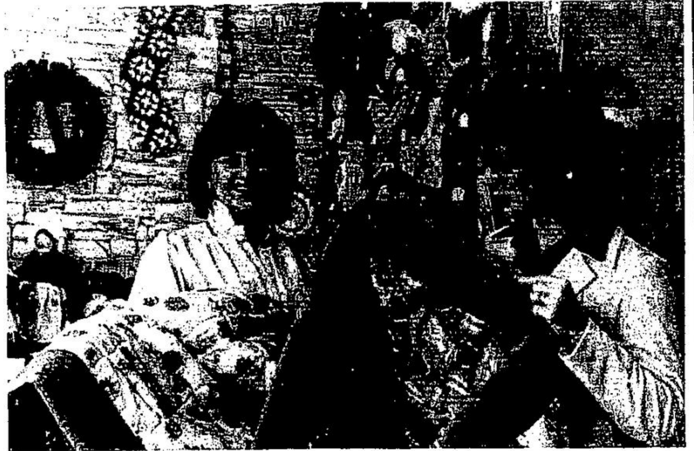
HAND MADE MERCHANDISE

The ladies say they always wanted a craft store and decided the community needed some retail outlet for all the hobbyists who have no place to sell their finished work.