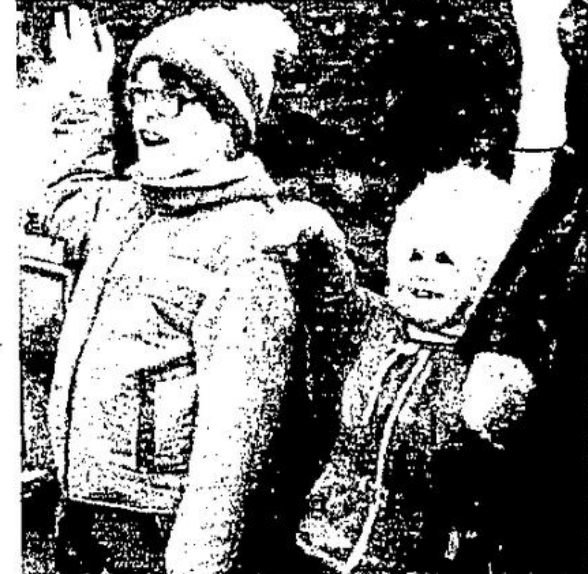
More photos inside