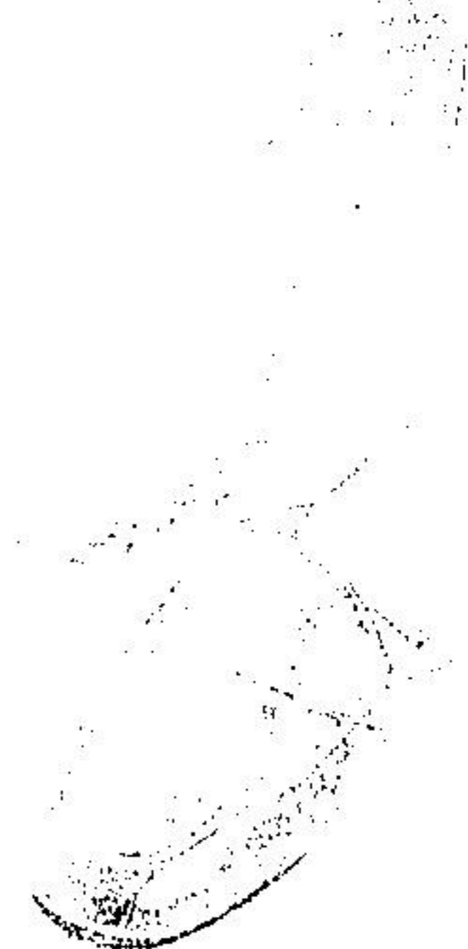
Slipper Into Comfort Your Choice

Waterproof, insulated work or hunt boots with sturdy steel shanks, lace-up fronts. Green only. Boys' sizes 1 to 6. Men's Sizes 7 to 12. 12.97 pr.