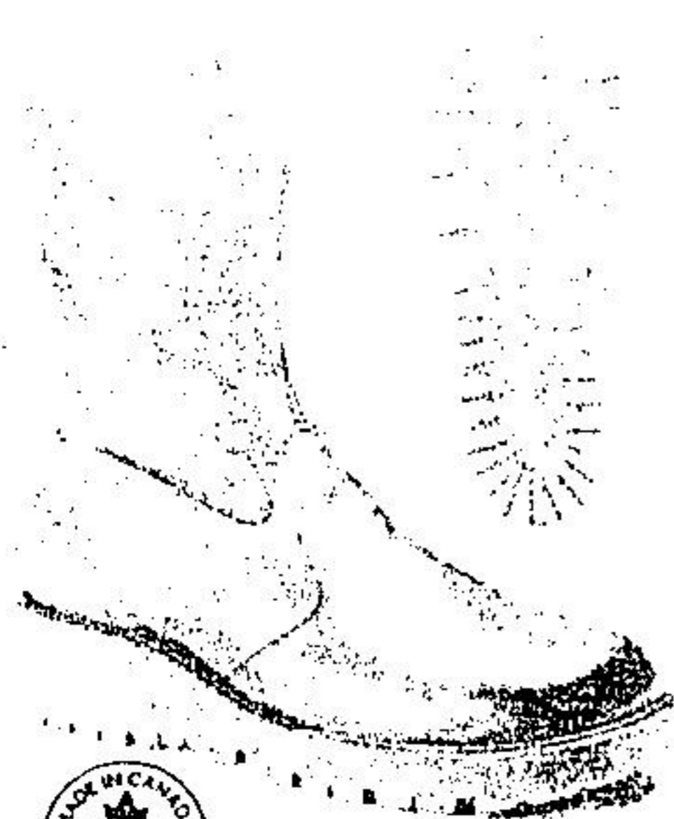
Men's Leather Pillow Boots