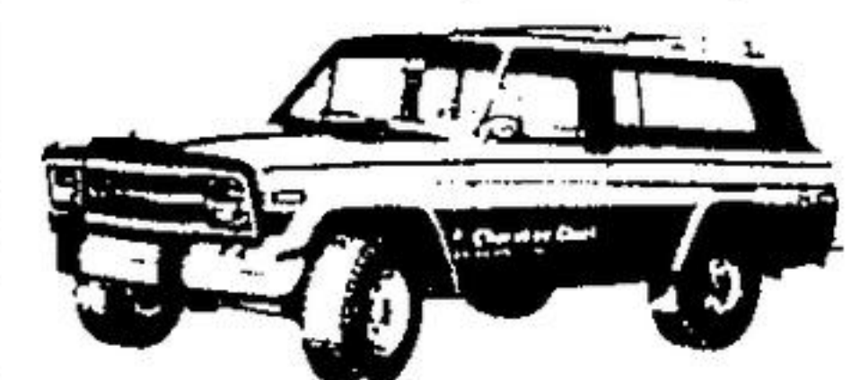
Jeep Cherokee Chief