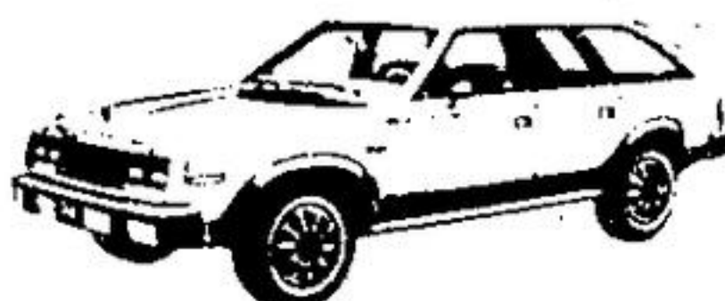
EAGLE WAGON also in 2 & 4 dr. sedan

The Eagle Has Landed! The Beauty of Four-Wheel-Drive