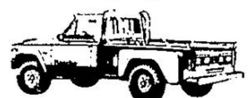
Jeep J-10 Honcho Sportside Pickup