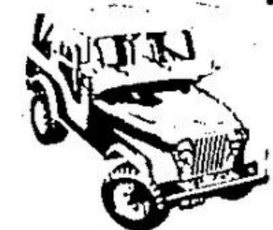
Jeep CJ5 Golden Eagle