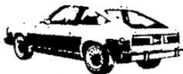
Spirit DL Liftback