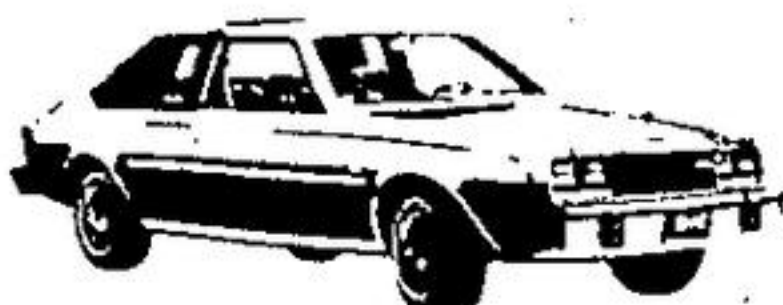
Concord Limited 2 Door