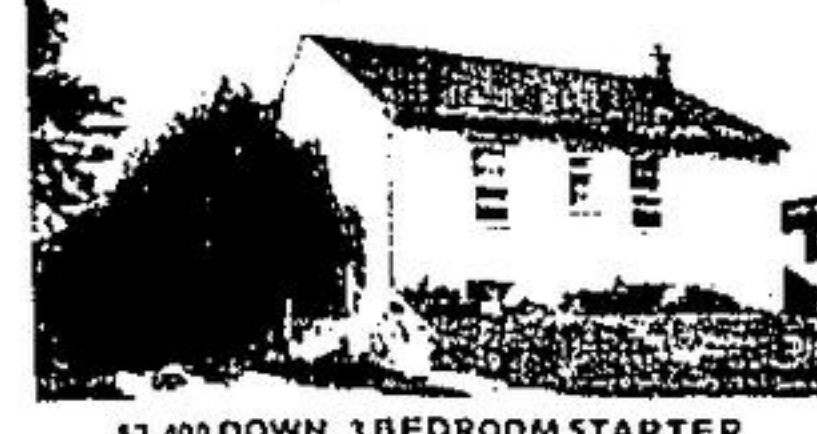
$2,400 DOWN, 3 BEDROOM STARTER HOME ON BIG LOT. YOU'LL HAVE TO ACT FAST. CALL MARG PARKER.