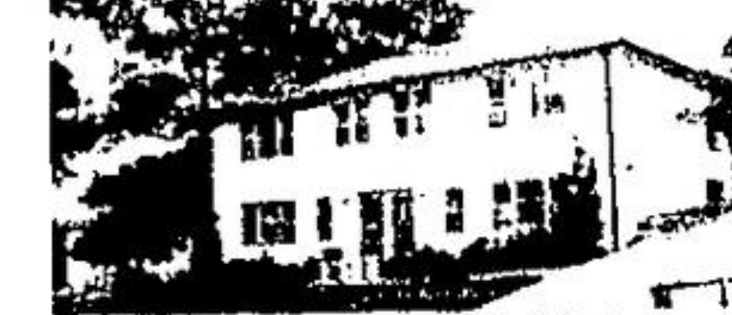
SOLID 4 PLEX, WELL KEPT BUILDING, 3-2 BEDROOM APTS. & 1-1 BEDROOM, FULLY RENTED. $89,500. CALL TENA KROEZEN.