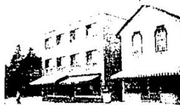
COMMERCIAL & APT. BLOCK 5 STORES & 7 APTS. ASKING $199,000. FULL DETAILS, FRED HARRISON

The Canada-wide real estate service - with 350 selected real estate offices in 220 communities across Canada