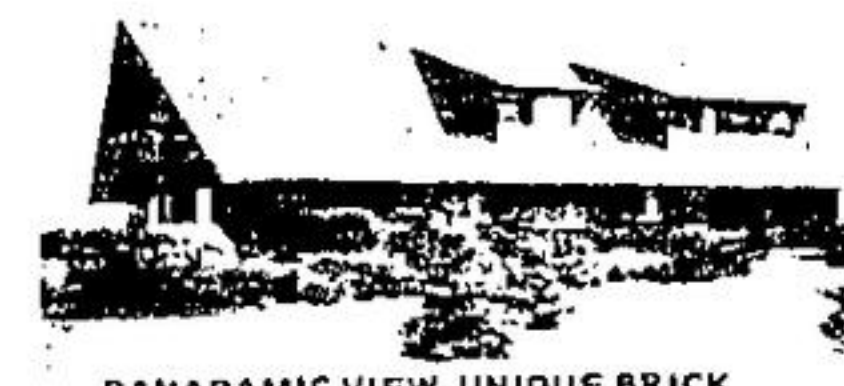
PANORAMIC VIEW, UNIQUE BRICK & CEDAR HOME ON 47 1/2 ACRES. FEATURES INCLUDE STREAM, POND, SAUNA. CALL PEGGY BOURASSA.