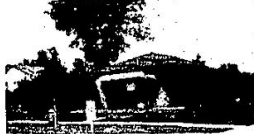
NEW LISTING, SINGLE CAR GARAGE, POTENTIAL IN-LAW SUITE WITH OWN ENTRANCE, ASKING $59,900. CALL ALICE POKLUDA.