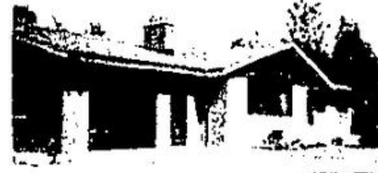
4 ACRES WITH CUSTOM BUILT HOME, EXTRA LARGE KITCHEN, 2 FIREPLACES, GAMES AND REC ROOM. ONLY $92,500. CALL MURRAY SMITH.