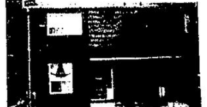
DOLLARS SAVED TO-DAY MEANS A BRIGHTER TOMORROW. 3 BEDROOM TOWNHOME LIKE NEW. FULL PRICE $43,000. CALL ALEX.