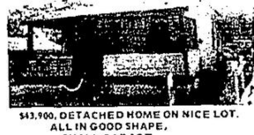
$43,900, DETACHED HOME ON NICE LOT. ALL IN GOOD SHAPE, SMALL GARAGE. CALL ALICE POKLUDA.