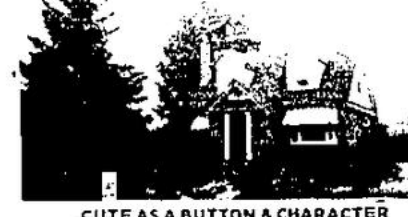
CUTE AS A BUTTON & CHARACTER SEPARATE DINING ROOM, BASEMENT FINISHED, DOUBLE GARAGE CALL ELLEN HOGG.