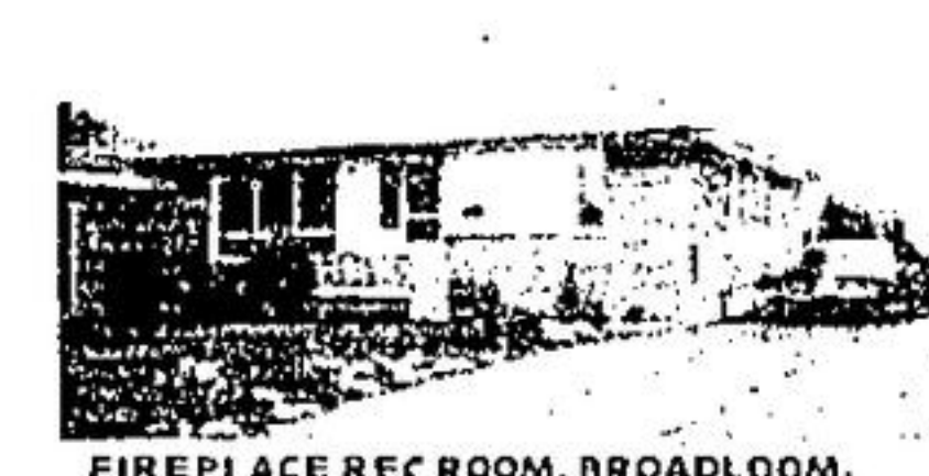
FIREPLACE REC ROOM, BROADLOOM, EAT-IN KITCHEN, PAVED DRIVE, ASKING $59,900. CALL HERB SPITZER.