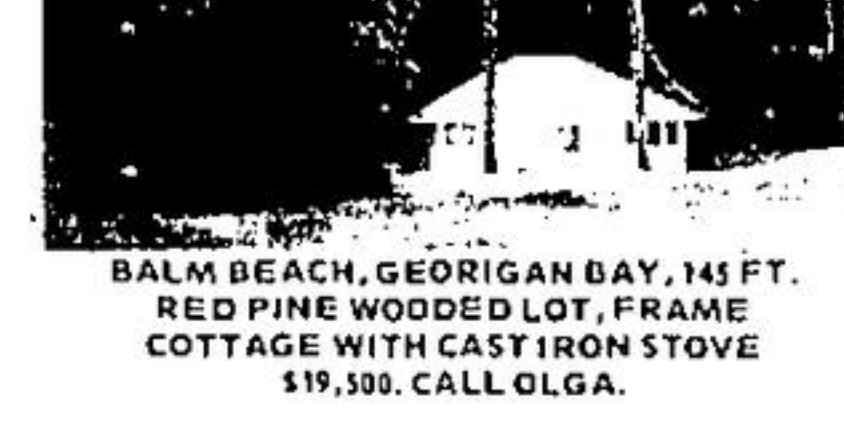
BALM BEACH, GEORIGAN BAY, 145 FT. RED PINE WOODED LOT, FRAME COTTAGE WITH CAST IRON STOVE $19,500. CALL OLGA.