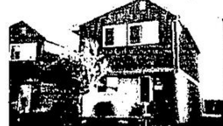
BRAMALEA $52,500, DETACHED 4 BEDROOM, PARTIALLY FINISHED REC ROOM, 4 APPLIANCES. ONLY $2,500 DOWN NEEDED CALL GLEN LUMBER.