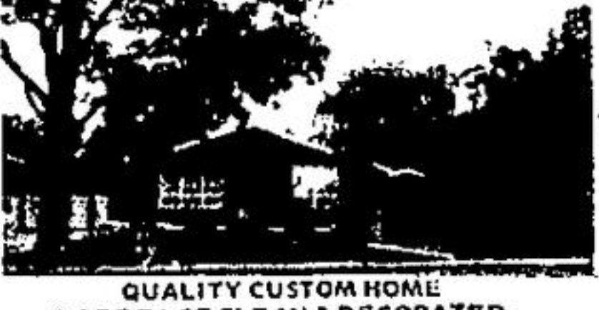
QUALITY CUSTOM HOME LARGE LOT CLEAN & DECORATED, 7 ROOMS, 2 EXTRA BATHS, OPEN POSSESSION. CALL MILLIE ADAMS.