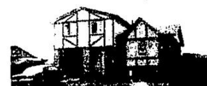
LARGE LOT, FULLY FENCED FAMILY ROOM WITH FIREPLACE PLUS WALK-OUT. BEAUTIFULLY DECORATED. CALL LYNN GILLIES.