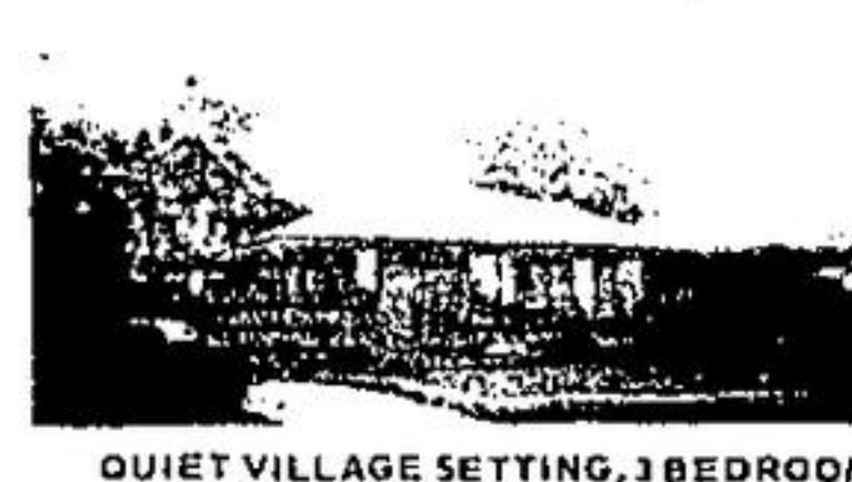
QUIET VILLAGE SETTING, 3 BEDROOM BUNGALOW ON LARGE LOT, REC ROOM WITH LOG BURNING FIREPLACE, ASKING $67,500. CALL GLEN LUMBER.