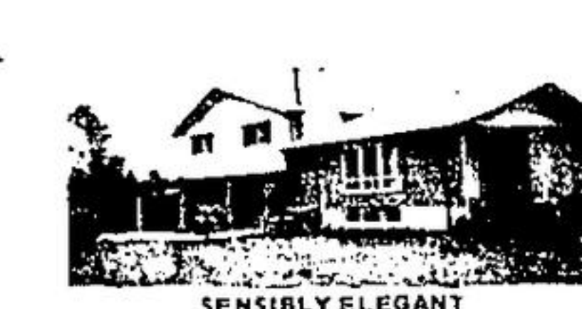
SENSIBLY ELEGANT COUNTRY HOME ON 15 ACRES TREES AND POND, 10 MIN TO 401 CALL SUE FOR PARTICULARS.