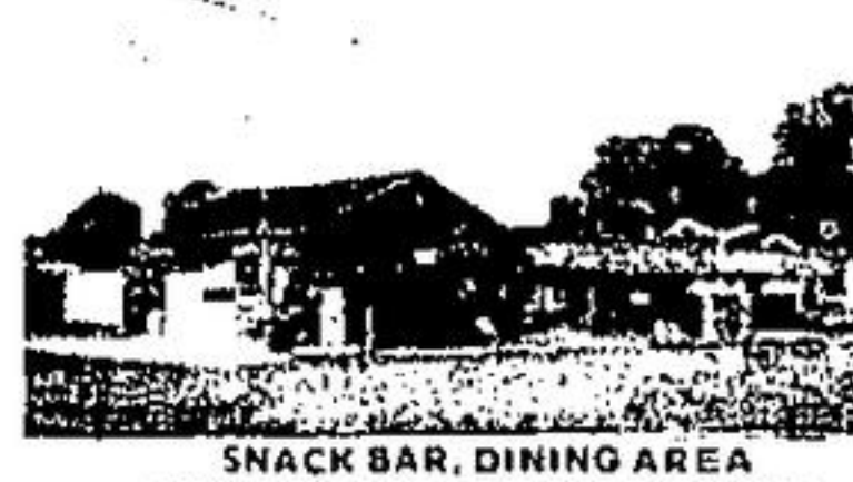
SNACK BAR, DINING AREA GAS BAR, POP SHOP, PLUS HOME ESTABLISHED BUSINESS. CALL FRED HARRISON.