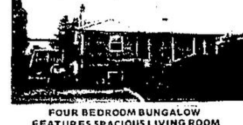
FOUR BEDROOM BUNGALOW FEATURES SPACIOUS LIVING ROOM GREAT REC ROOM WITH BAR, 5 APPLIANCES. CALL OLGA.