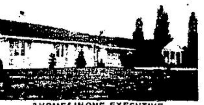
2 HOMES IN ONE, EXECUTIVE MANSION & GUEST HOME 14 ACRES IN TERRA COTTA $245,000. CALL TENA.