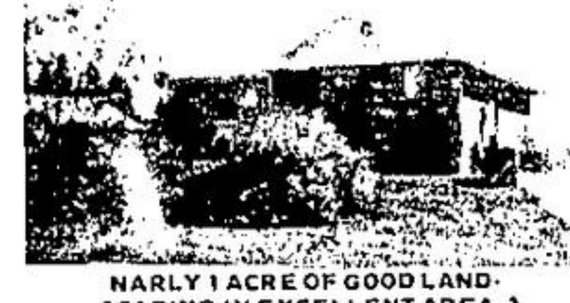
NARLY 1 ACRE OF GOOD LAND, SCAPING IN EXCELLENT AREA, 3 BEDROOM BUNGALOW IN MINT CONDITION, CALL ELLEN HOGG.