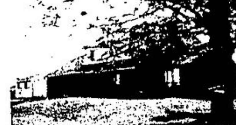
IMMEDIATE POSSESSION, BEING SOLD UNDER REPLACEMENT VALUE. MANY EXTRAS. $40,900. CALL MARG PARKER.