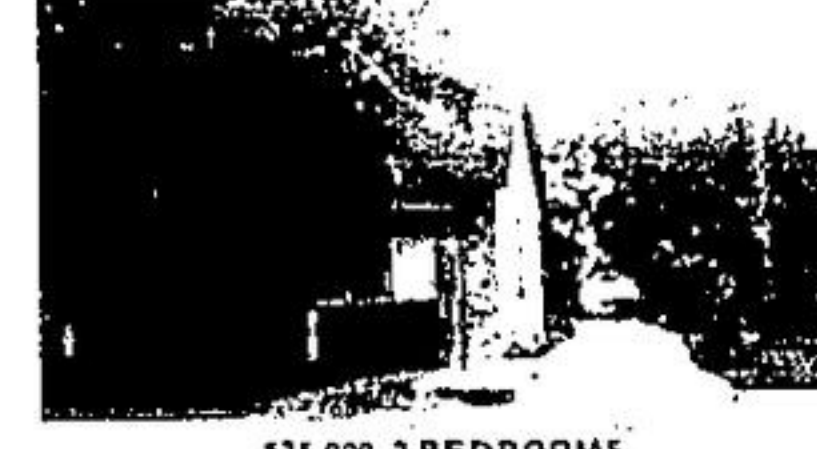
$35,000, 2 BEDROOMS GOOD STARTER HOME, LARGE EAT-IN KITCHEN. CALL VAL.