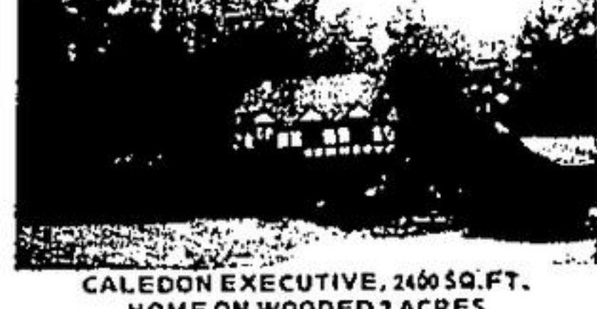
CALEDON EXECUTIVE, 2400 SQ. FT. HOME ON WOODED 2 ACRES AVAILABLE FOR SALE OR LEASE CALL JUNE CARSON.