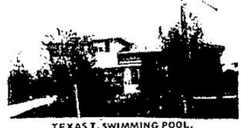
TEXAS T, SWIMMING POOL, GORGEOUS RAVINE LOT 3 BEDROOM SIDE SPLIT, CALL FLO MATHESON.