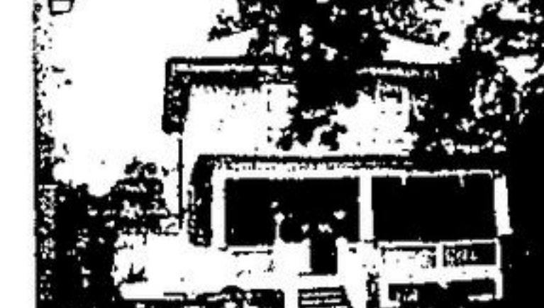
ACTON 4 BEDROOM, FORMAL DINING BUILT IN CUPBOARDS, BOOKSHELVES DEEP LOT, SUNDECK, OPEN POSSESSION. CALL MURRAY SMITH.