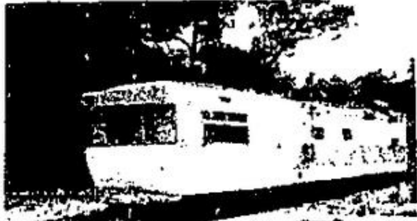
2 BEDROOM TRAILER, FURNISHED. MUST BE MOVED. FULL PRICE ONLY $4,900. LOCATED AT KIYOS GARAGE, 21 MILL ST. CALL HERB SPITZER.