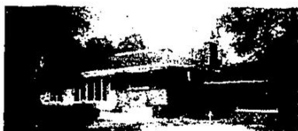
LONELY 28 Acres, no one around, $129,000.00