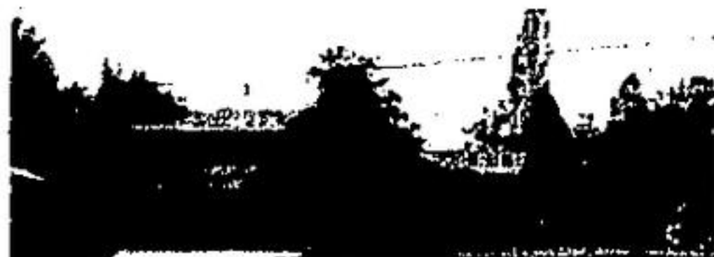
BEAUTIFUL NORTH HALTON Close to town, lots of room, note the view, $120,000.00