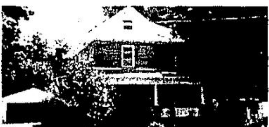
WALK TO GO STATION Quality features: Stained glass leaded windows, hardwood floors, carved oak mantle, $82,500.00