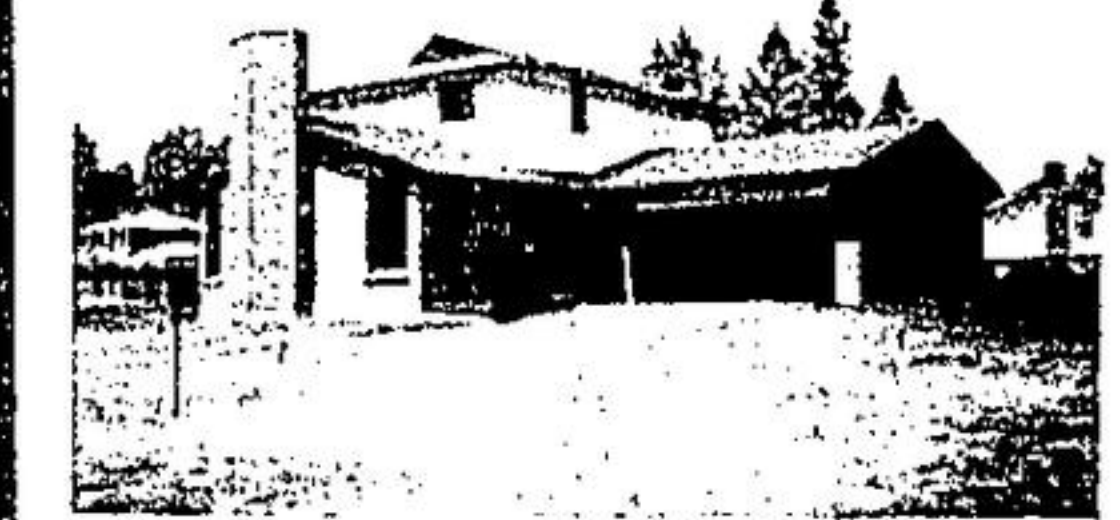
CATHEDRAL CEILING IN LIVING ROOM Standing in your kitchen you can watch the late evening sunlight on the evergreen treetops. It is a sight one can have forever. Plus cathedral ceiling and floor to ceiling brick fireplace to add warmth and charm. The 2 x 6 exterior wall with Georgetown's own Twin Windows! This will help keep those fuel bills down. $109,700.00