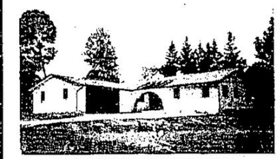
NATURAL LIGHT PLUS 2 WALK-OUTS Come and tell us what plants you would use in the front courtyard. There are three mature evergreens at the back of the property which will start your landscaping plans when you move in. Open space, family room, kitchen, three bedrooms. $116,700.00.

Mullen Place OPEN for inspection Sales Office Open Sat. & Sun. 1-4:30 p.m. Mon. & Tues. 6:45 - 8:30 p.m. Go north on Mountainview from No. 7 Hwy. 2K.