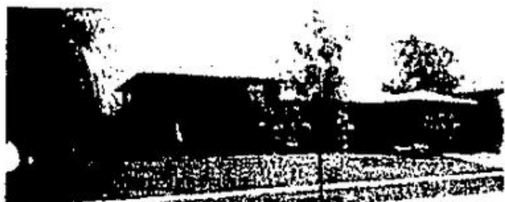
ABSOLUTELY BEAUTIFUL Elegant decorating, very private landscaped lot, $69,900.00