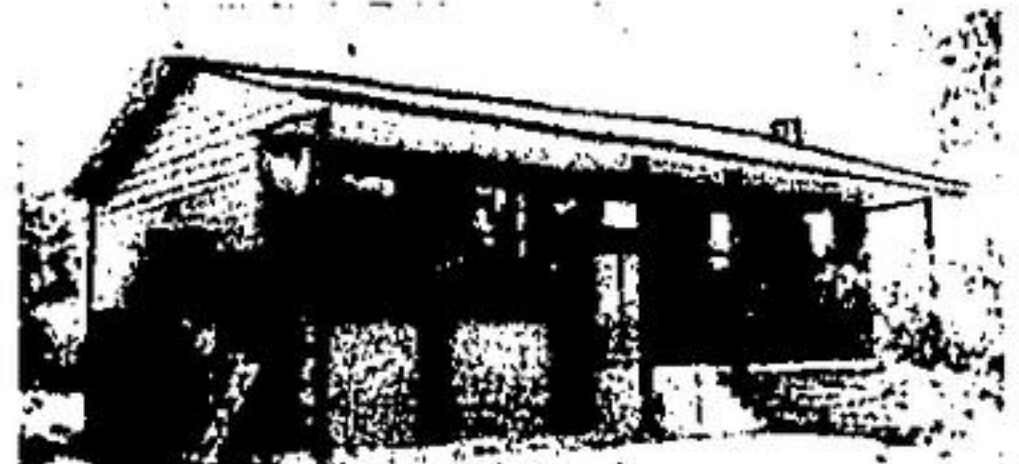
READY NOW Boulder is done, you can move in, $119,900.00