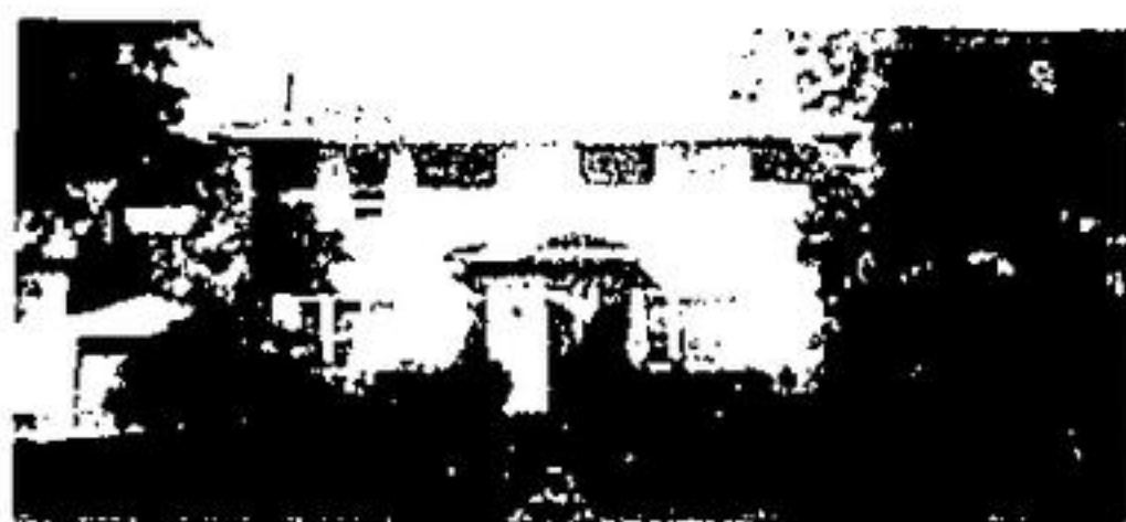
SPACIOUS & ELEGANT Formal living & dining rooms, 4 big bedrooms, luxury extras, $98,700.00