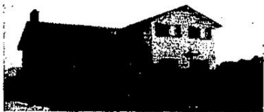
WHAT'S NOT TO LIKE Sparkling clean family home on 1/4 of an acre, $74,900.00