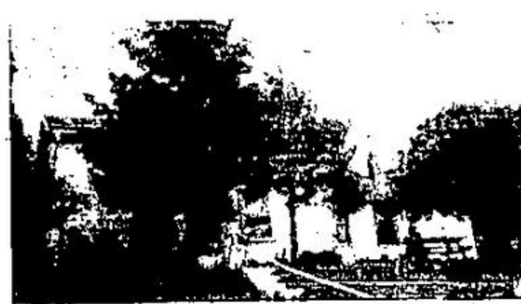
GLEN WILLIAMS Small home, big lot, modern conveniences, $44,900.00