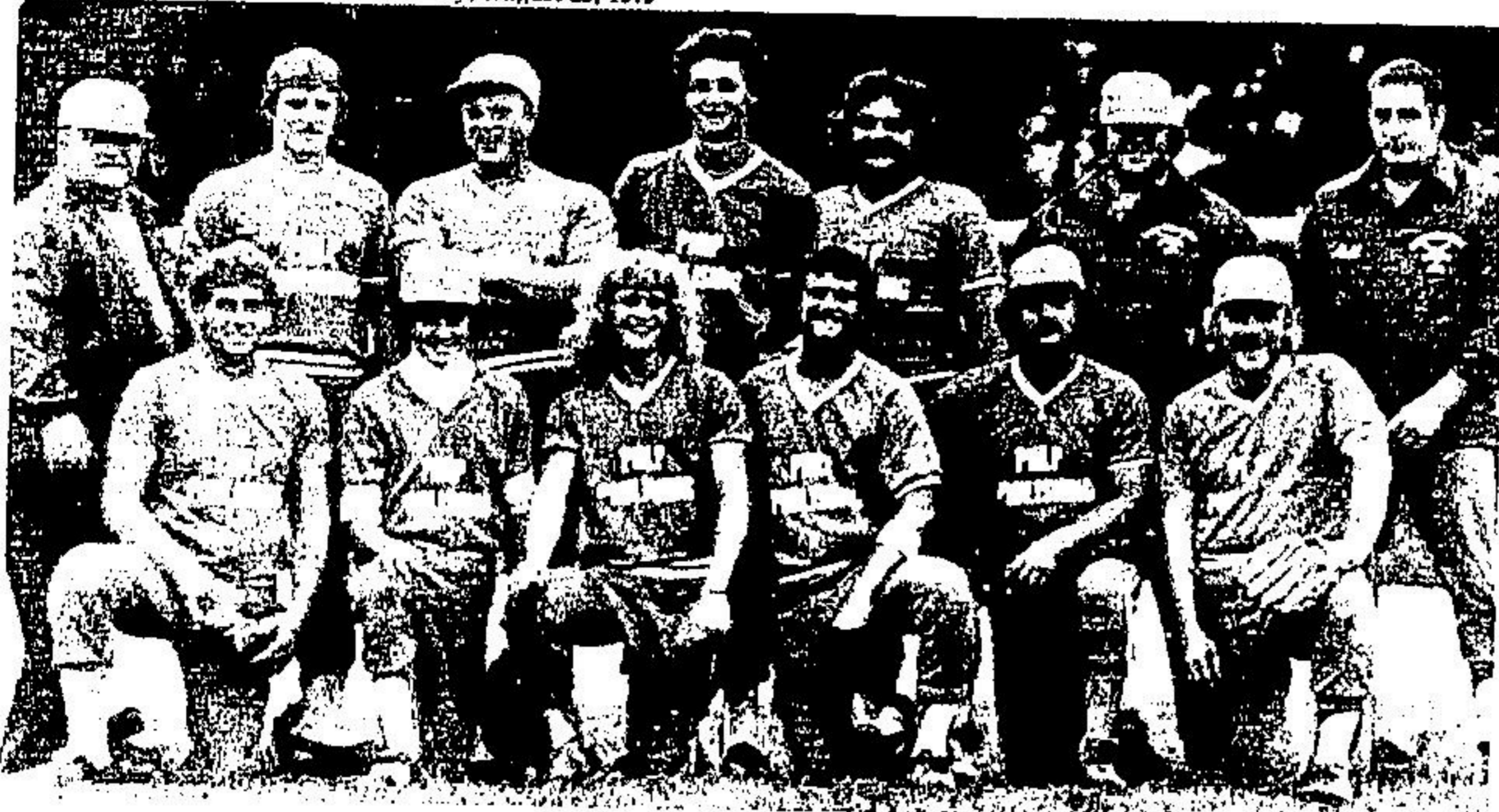
Philp Publishing has won the Labatt's Trophy as champions of the Georgetown Industrial Fastball League. In the championship final they defeated Akers-Clark in three