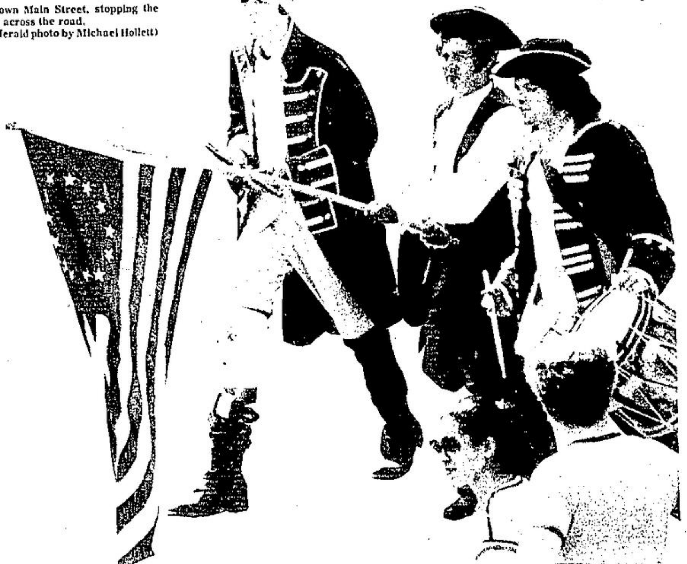
The Spirit of '76 came marching down Main Street Sunday, carrying the symbols of American glory to commemorate July 4 as Independence Day. Sunday's movie scenes will be presented in the film as July 4, 1972, while Monday's scenes will depict the