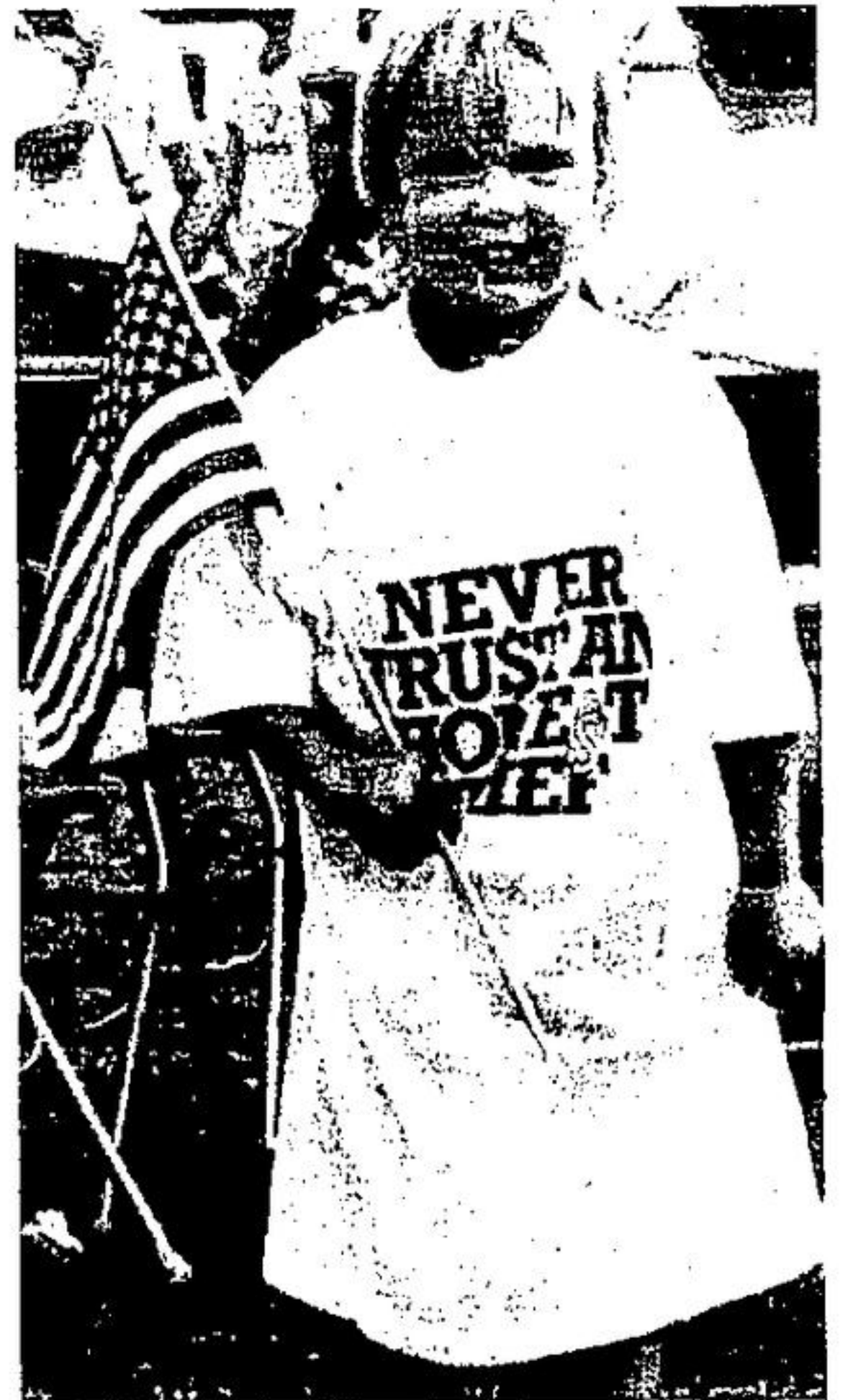
Wearing a souvenir of Hollywood's visit to Georgetown, this young movie fan was among the lucky 2,000 who lined up for the free movie T-shirts distributed in Fairgrounds Park following the filming of parade sequences downtown. The film's producers are mildly perturbed that all their extras didn't get the token T-shirts, and have ordered another 500 to fill the need.