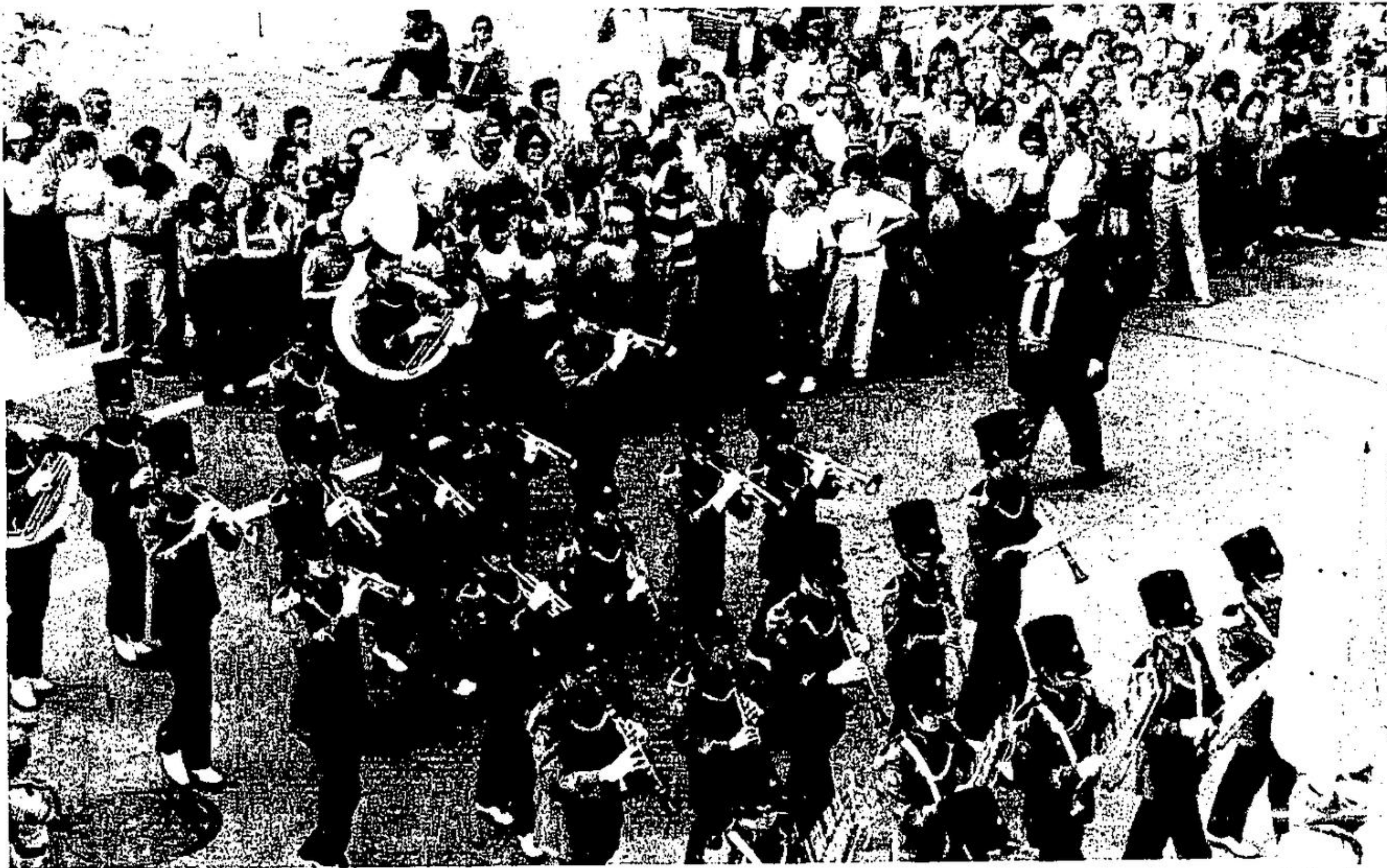
A big star for a big role, the celebrated Orson Welles made his first appearance in Georgetown Sunday during the filming of parade sequences for Never Trust an Honest Thief . As Sheriff Paisley of Madison, New York, Mr.