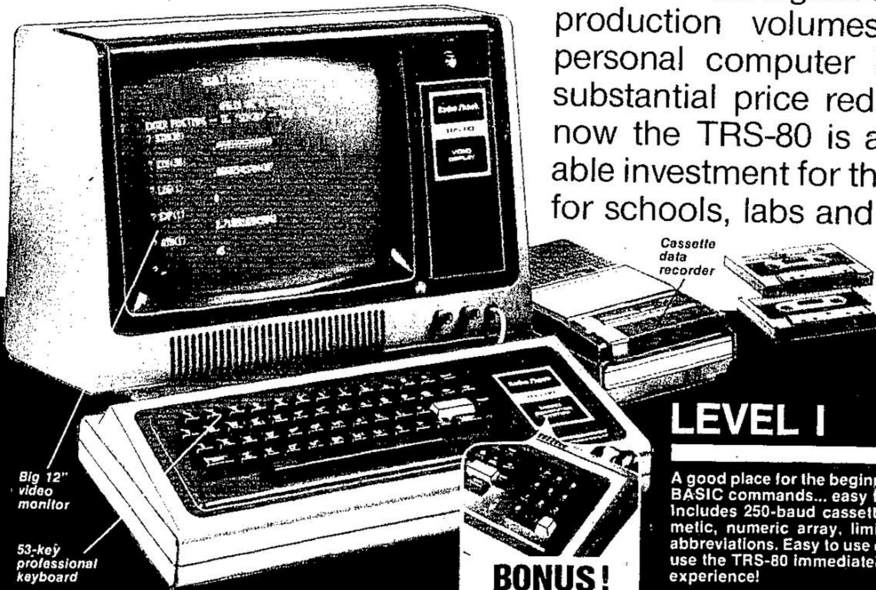
Big 12" video monitor

Latest technological advances and high production volumes of our unique personal computer have made these substantial price reductions possible... now the TRS-80 is a practical, affordable investment for the home, as well as for schools, labs and small businesses.