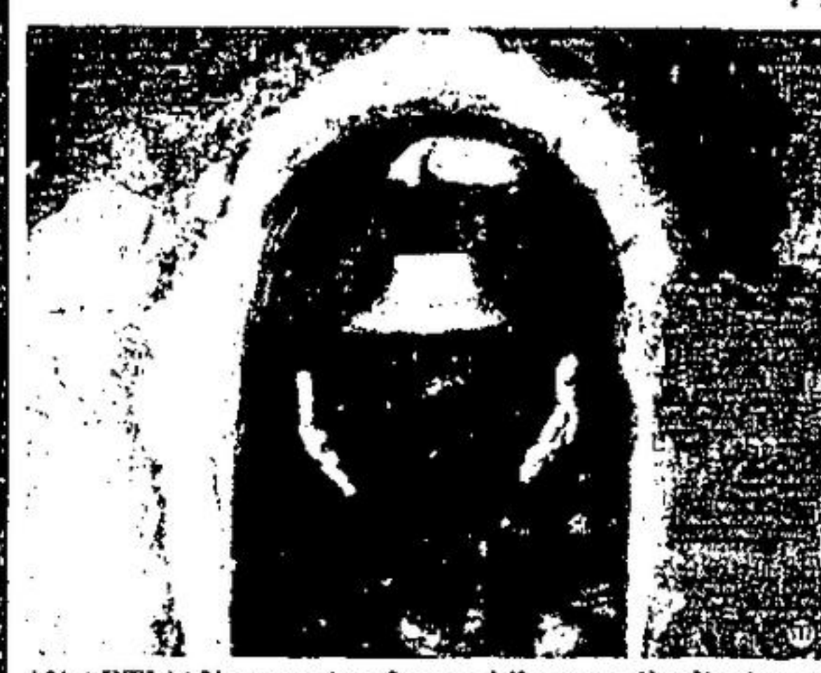
AN ARTISAN emerging from a kiln proudly displays a finely crafted piece of ceramic-ware, delicately incised with wavy lines.