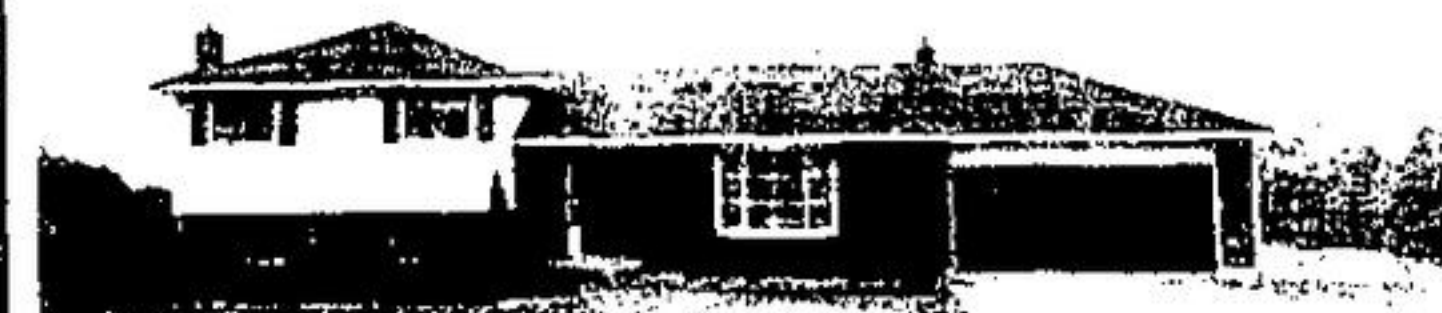
WHERE IN THE COUNTRY $84,500.00 IMMEDIATE POSSESSION

Lovely lot 90' x 300' full of mature vegetation. The house is 2 bedroom, bungalow with large living area with sliding door walkout. Asking price $57,900.00. Call John Caton.