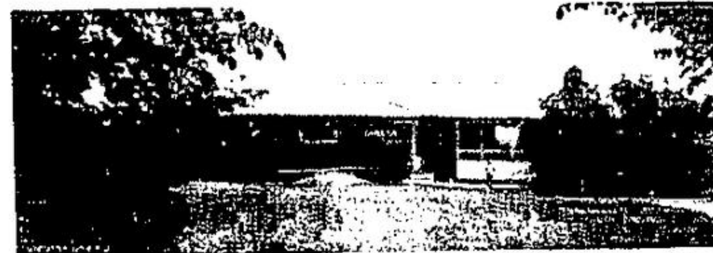
VENDOR HAS TO MOVE! $85,000.00

This one acre land in town offers country living, privacy and conveniences. It is a three bedroom, brick bungalow with a double car garage, 1-4 piece and a 1-2 piece bathroom. Stone fireplace in the L shaped livingroom and diningroom. Spacious eat in kitchen, finished recreation room with wainscoting. EXTRA! Humidifier, broadloom where laid, drapes, curtains, shelves, brick barbecue grill, large shed and sundeck off of the master bedroom for those hot summer nights. Open to offers. Call Coring DePaoli.