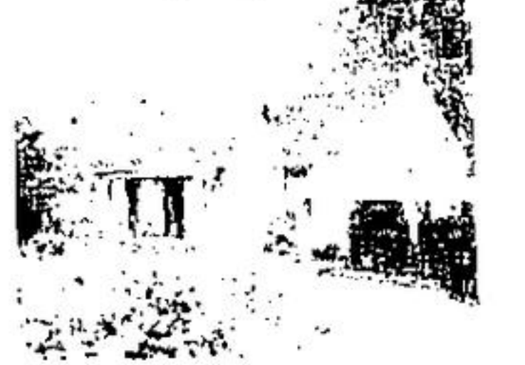
4 MILES TO TOWN

This one acre land in town offers country living, privacy and conveniences. It is a three bedroom, brick bungalow with a double car garage, 1-4 piece and a 1-2 piece bathroom. Stone fireplace in the L shaped livingroom and diningroom. Spacious eat in kitchen, finished recreation room with wainscoting. EXTRA! Humidifier, broadloom where laid, drapes, curtains, shelves, brick barbecue grill, large shed and sundeck off of the master bedroom for those hot summer nights. Open to offers. Call Coring DePaoli.