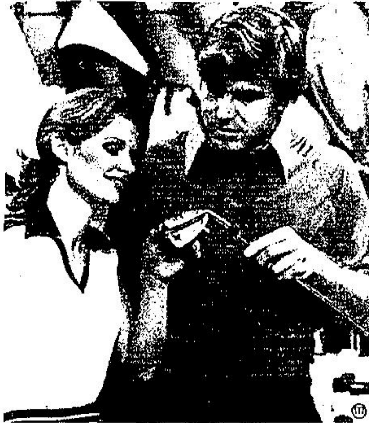
DESIGNED SPECIFICALLY for a woman's game is the Butterfly series of golf clubs from PGA Golf. Each iron and wood is weighted at the bottom of the club so a woman's swing can get the ball airborne easily, quickly and accurately.

designed for a woman's swing. Since women tend to swing slowly, the Butterfly irons' flange lowers the center of grav-