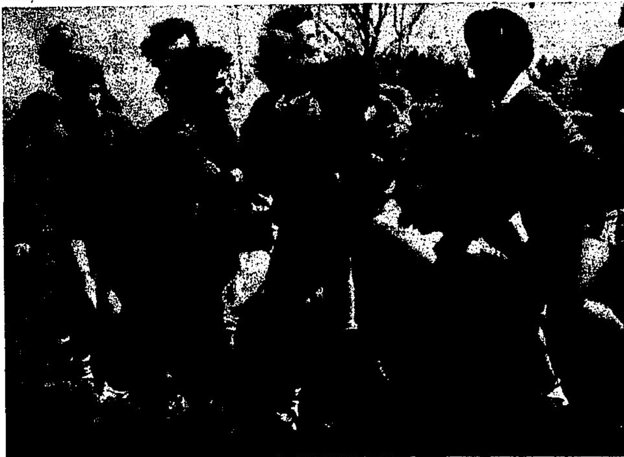
The action was rough and tough as usual in the Peel-Halton Rugby championships. The GDHS junior Rebels are in action above. The midget team did the best of the Rebel squads as they qualified for the OFSAA championship.