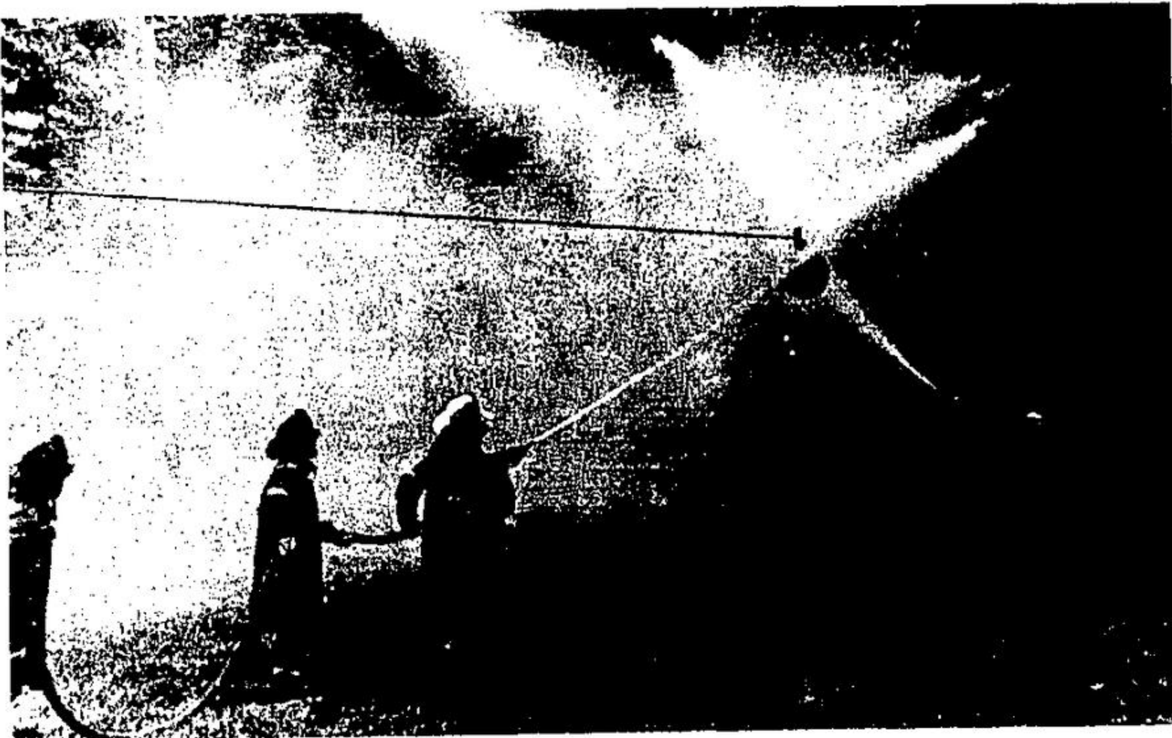
The Georgetown detachment of the Halton Hills Fire Department put up quite a show with their waterball fight at Bang-O-Rama Monday. With the light breeze that was blowing, a