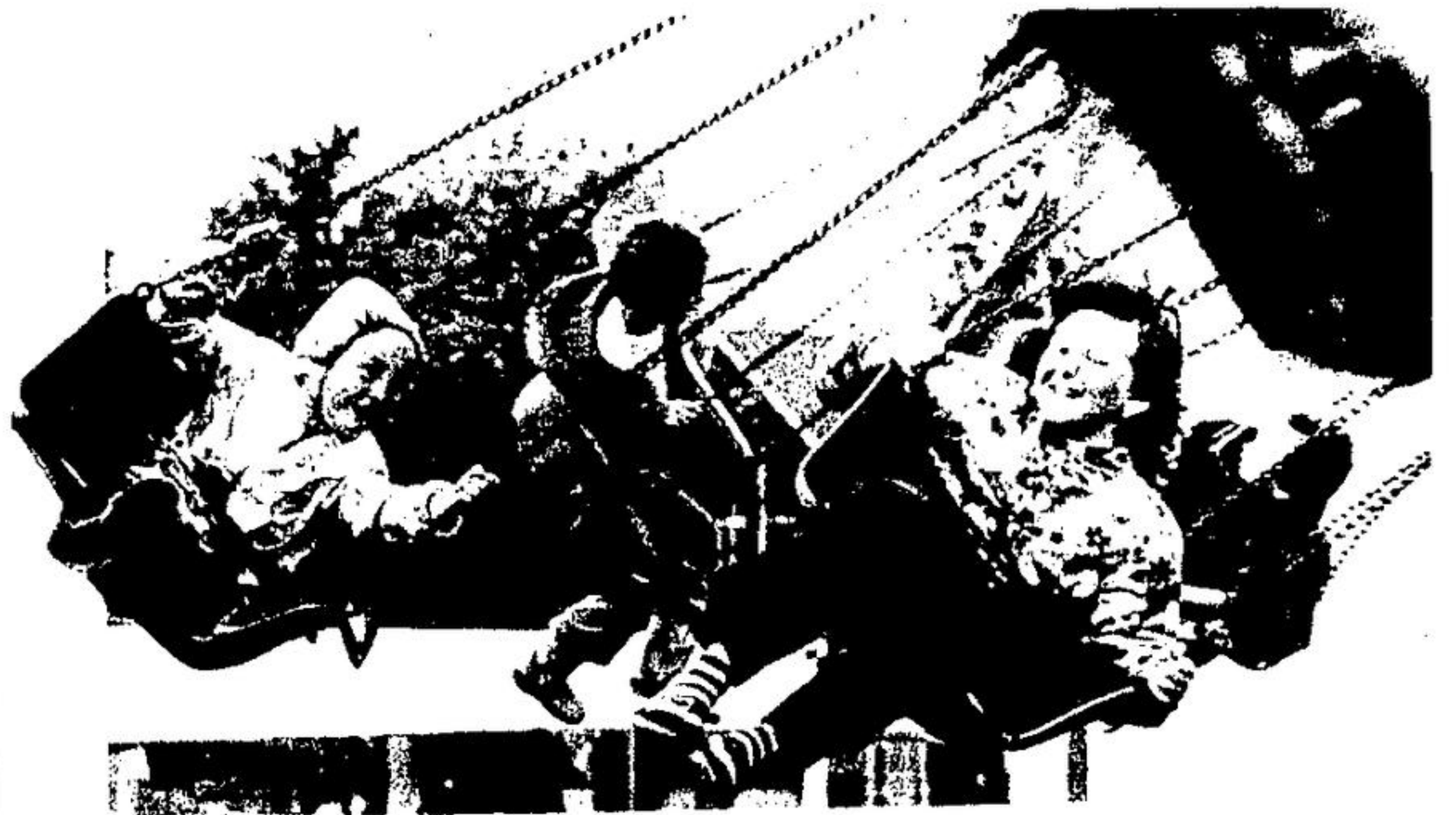
It may not be the flying trapeze but these daring young