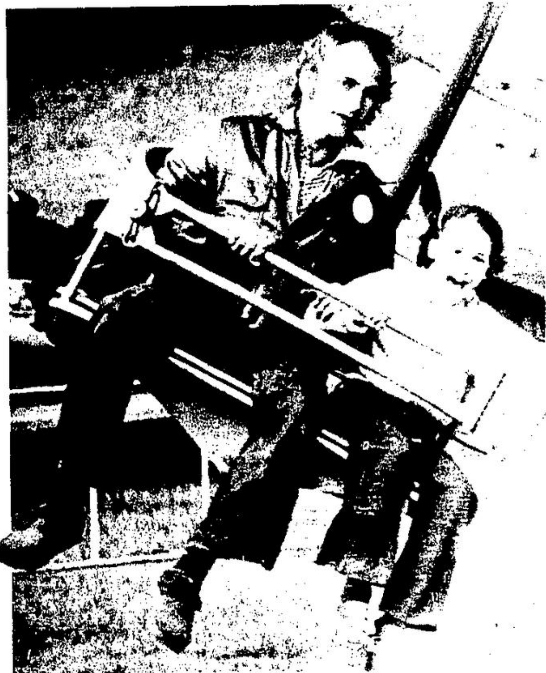
This father and daughter team got their money's worth as they got an aerial view of the fun and few good spins aboard the paratrooper ride.