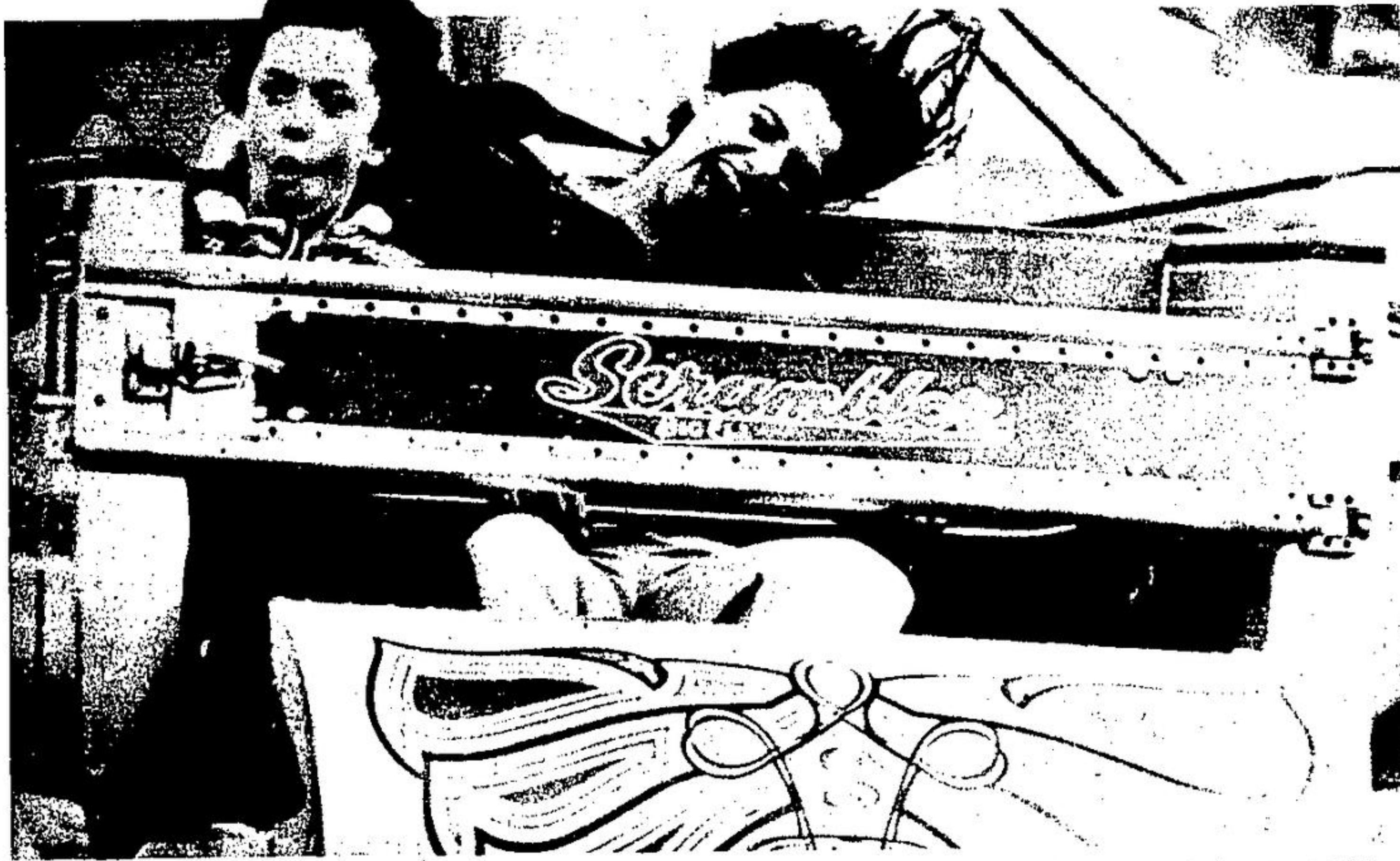
Whaddaya mean dizzy? These young girls don't seem the least bit concerned about the spins as they fly happily around on the Bang-o-rama