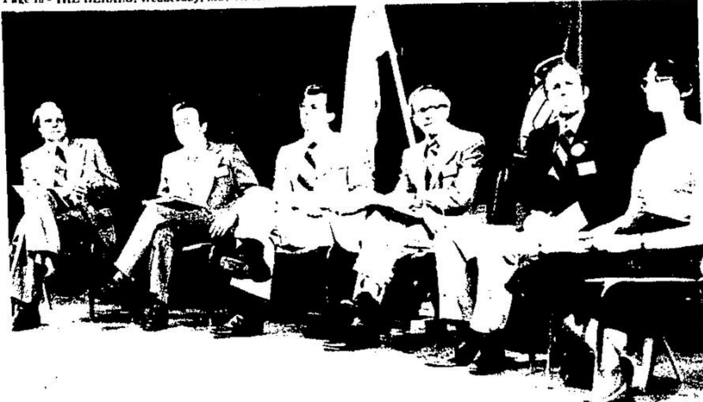
Brampton area voters had a chance to hear the views of the candidates for the riding of Brampton-Georgetown at an all-candidates' meeting at the Bramalea Civic