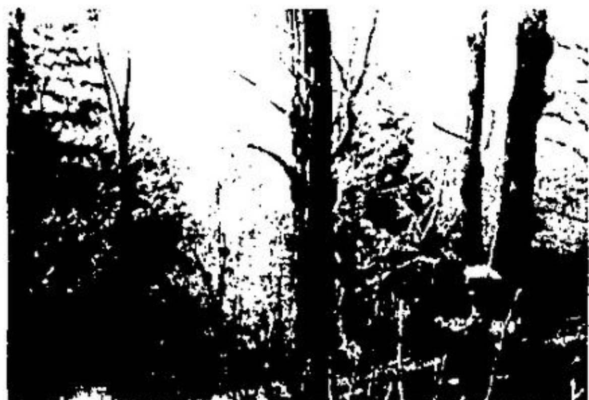
BRAND NEW LISTING $89,900

Like a private park? See this spacious exec. home backing onto a well landscaped ravine lot, large shade trees, 4 bedrooms, family room with cosy stone fireplace, 2 car garage. Call Eileen Nicol Polzler Real Estate Ltd., Realtor 227-666 877-1493