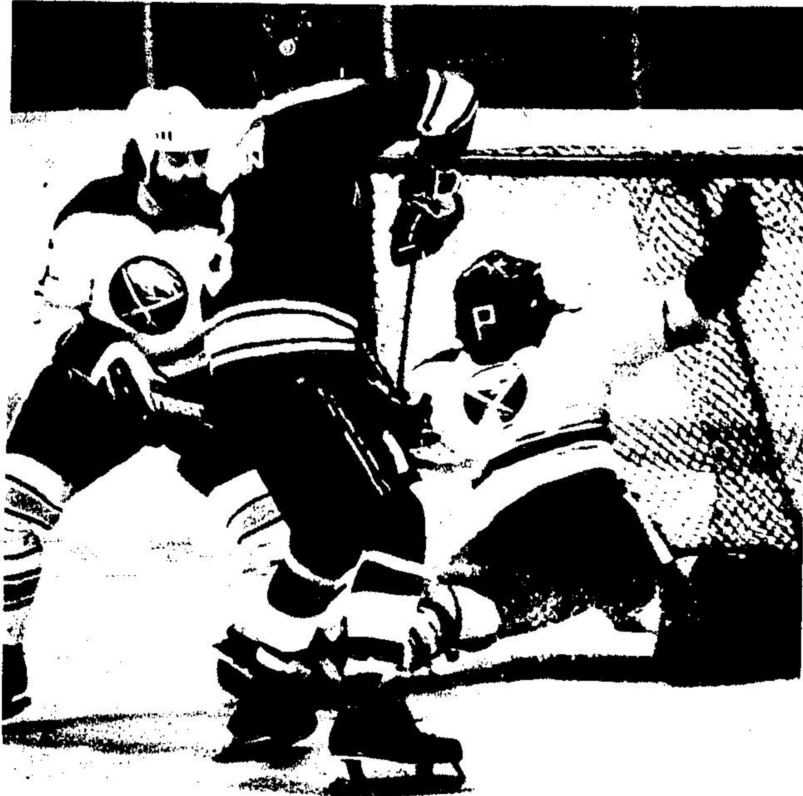
A big reason Philp Publishing was able to oust Norval as champions in the Georgetown Industrial League was that their goaltending was superb. In the above

The injuries to the Norval club had to figure in the outcome somewhat, but the excellent Philp team deserves much credit for coming back and taking the championship.