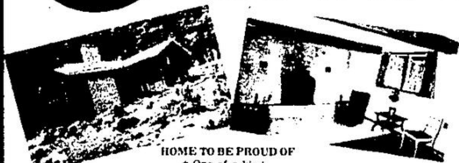
HOME TO BE PROUD OF * One of a kind.