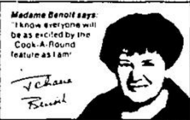
Madame Benoit says: "I know everyone will be as excited by the Cook-A-Round feature as I am!"

When you purchase a Panasonic microwave oven illustrated below, your participating dealer will present you with a coupon redeemable for $60.00 when received by Panasonic Sales Branch, 40 Rensselaer Drive, Rosdale, along with a copy of your Bill of Sale covering the purchase of a Panasonic Microwave oven (NE-7910C, NE-7810C, NE-5650C, NE-5510C) between the dates of January 15, 1979 and March 16, 1979. Offer limited to one rebate per purchase.