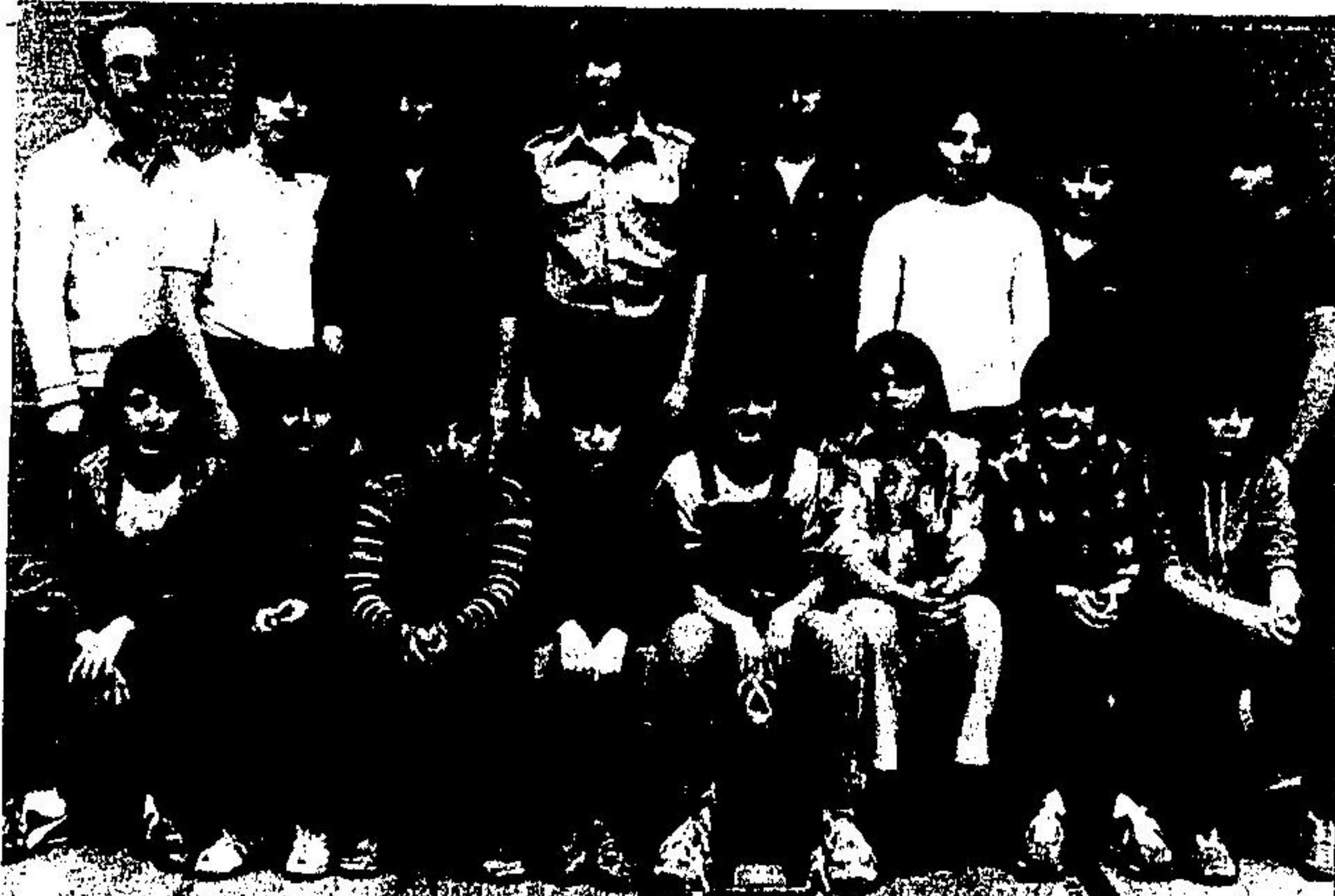
Centennial Middle School stickhandled its way to a victory in a round robin hockey tournament at the Acton arena on March 14. They defeated W.I. Dick 2-1 in the first game, then went on to take Stewarttown, 3-1, and McKenzie-Smith 6-2. Centennial handily won the final game against W.I. Dick by a score of 5-1. Players on the Centennial