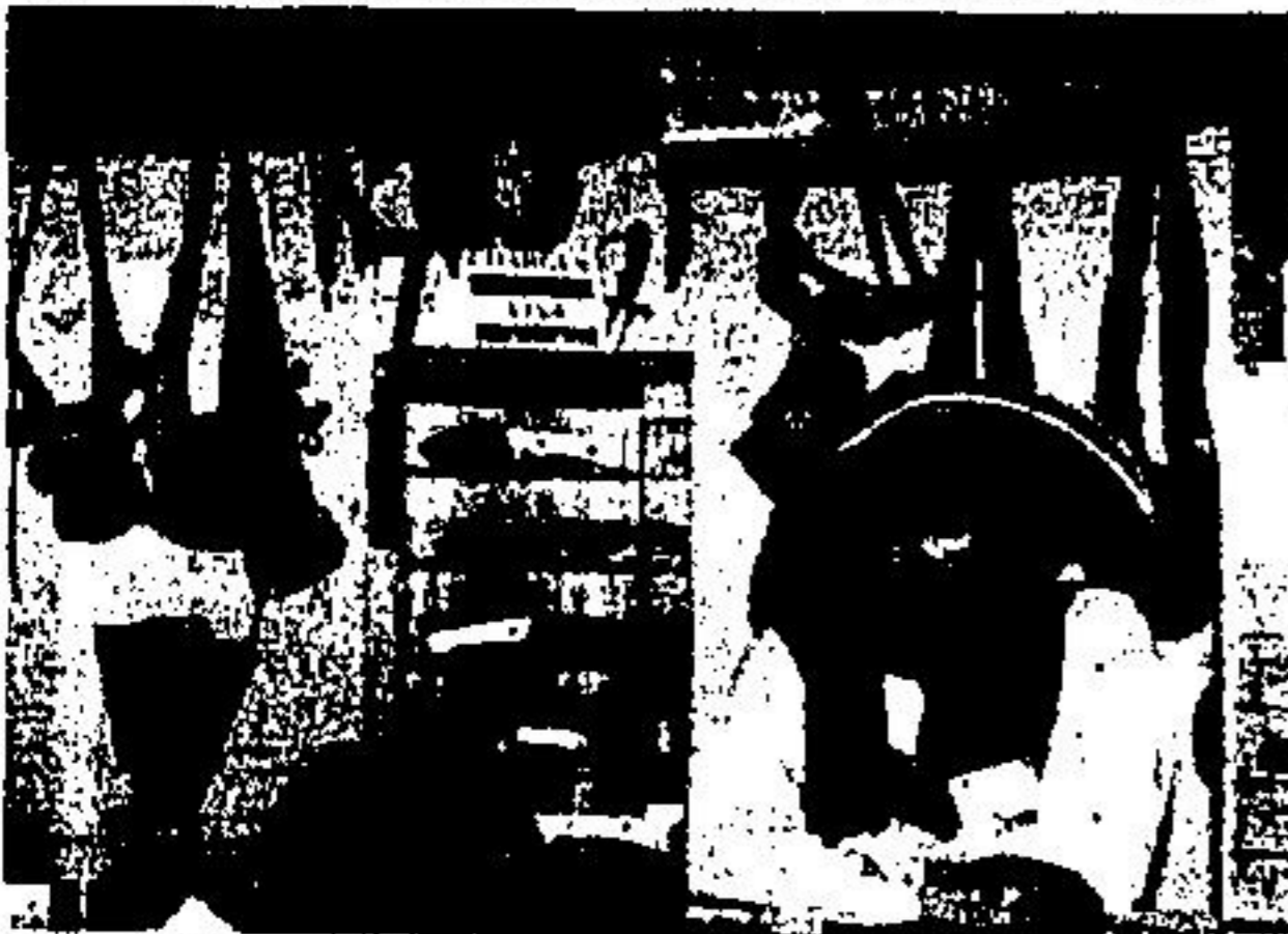
SPORTSMAN'S SHOW DISPLAY

Custom Knife makers CEBEK and FERRI teamed up and are displaying their knives. Truly beautiful as well