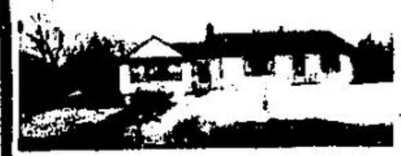
100 x 163 YARD

IDEAL FAMILY HOME 4 bedroom, 2 storey home could be the home you are looking for. Spacious kitchen with lots of cupboards and built in stove, adjoining dining area, cosy living room. Full basement with rec room, plenty of room for the children to play indoors and treed yard when they go out with trees and shrubs. Priced at $62,900. Make an offer.